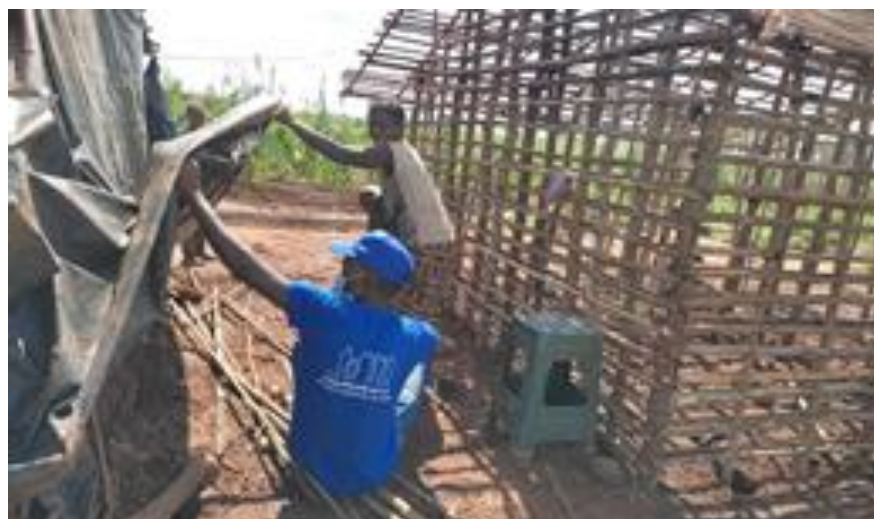
Site Assessment in Corrane