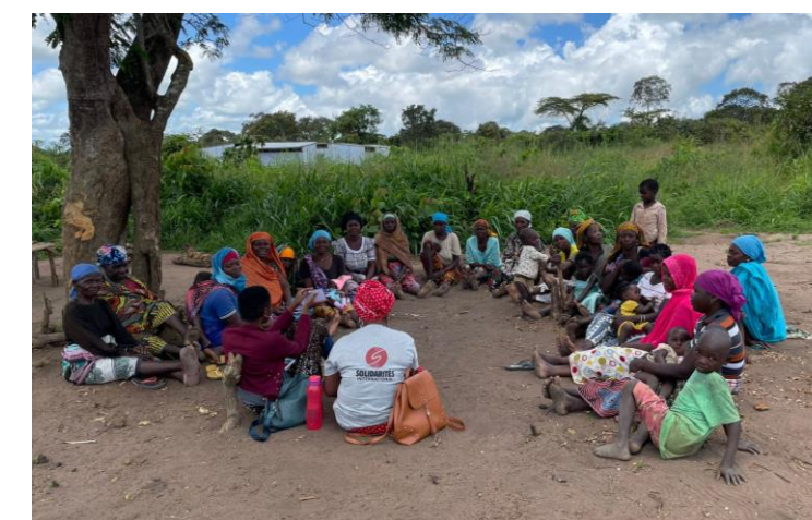
Focus Group Discussion in Nandimba Photo/Solidarites International/ 2022

Most of the cases were related to the NFI sector (33%) and FLS (31%) followed by Shelter (18%).