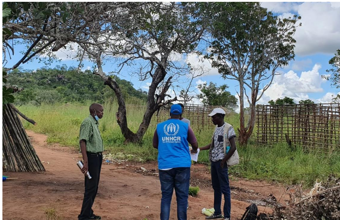
Site Planning and relocation Monitoring in Massingiri 2022