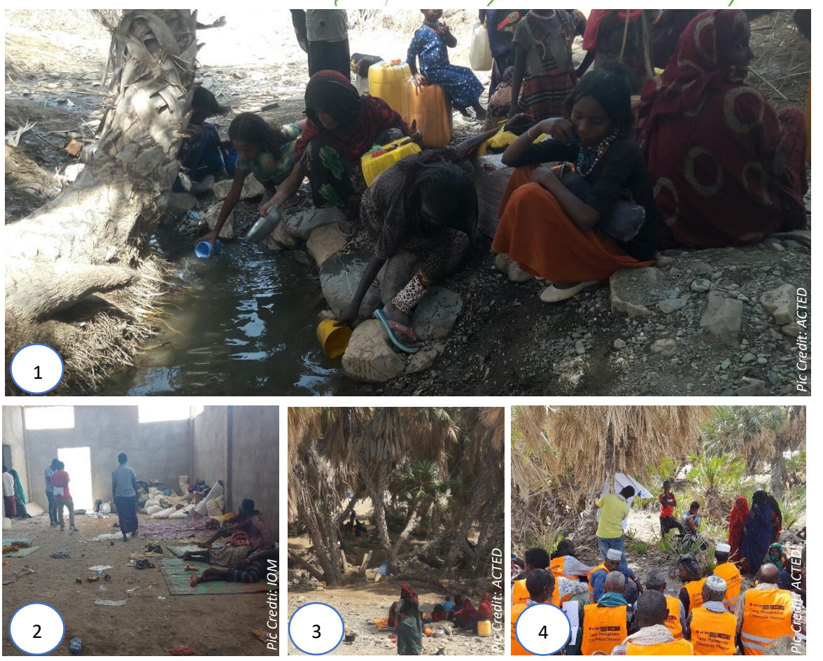
IDPs sourcing water for drinking and for domestic use from open spring in Harsuma IDP site. This poses the risk of contracting waterborne diseases. IDPs living in one big hall with no privacy partitioning in Afdera IDP site. IDPs in Harsuma living in open space due to lack shelters thereby exposing IDPs to extreme climatic elements and the risk of wild animal attack. Basic CCCM training to camp management committees in Harsuma IDP site