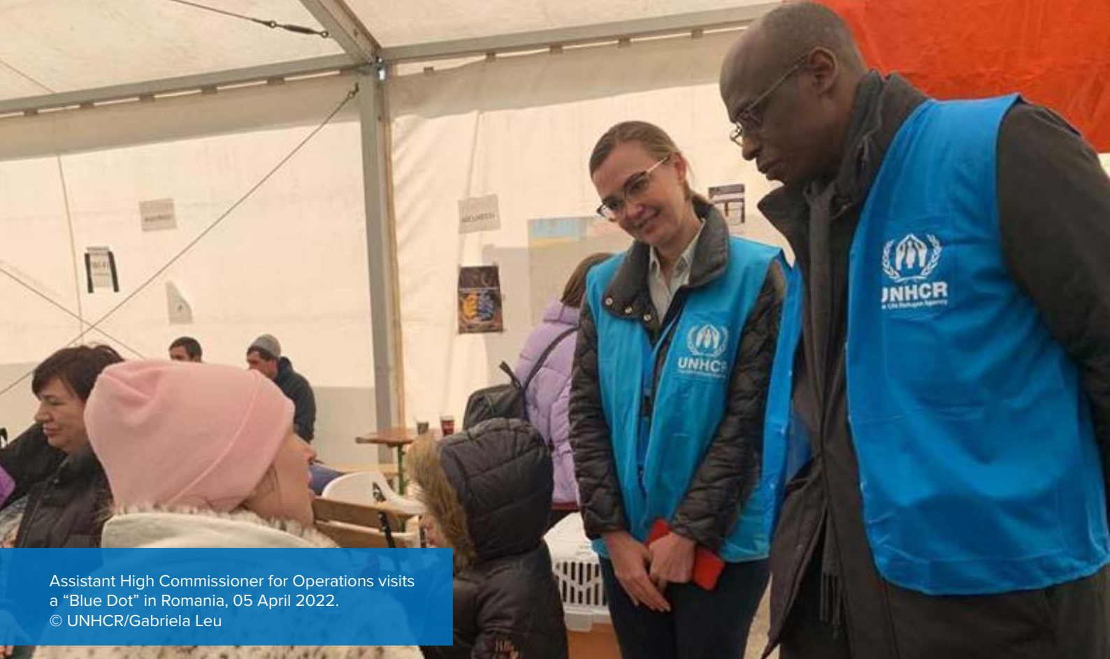
Assistant High Commissioner for Operations visits a “Blue Dot” in Romania, 05 April 2022.