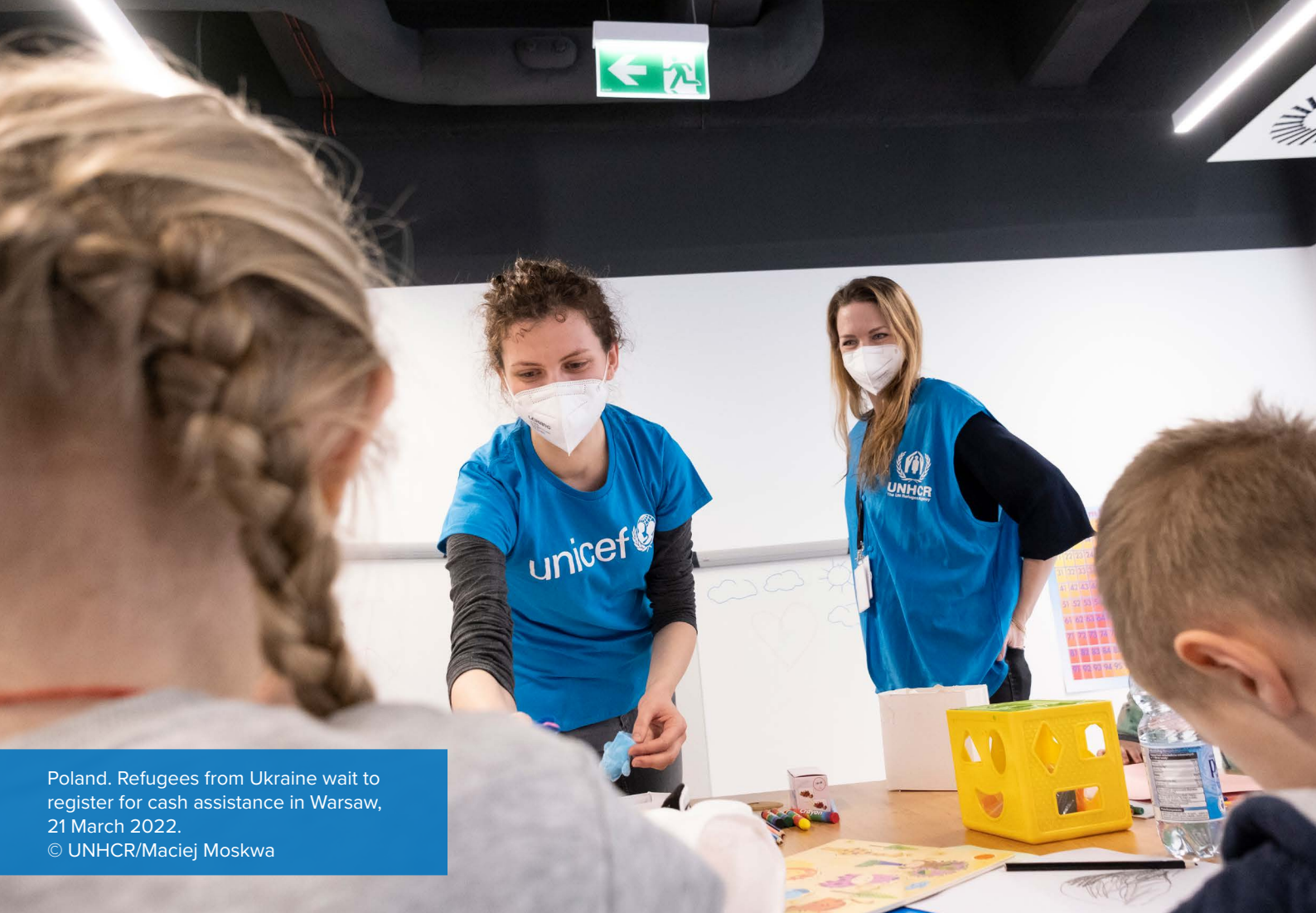
Poland. Refugees from Ukraine wait to register for cash assistance in Warsaw, 21 March 2022.