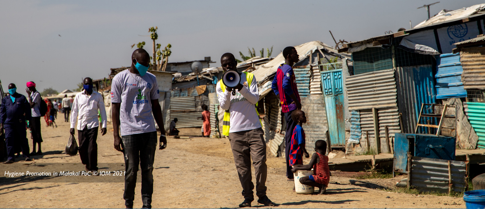
Hygiene Promotion in Malakal PoC