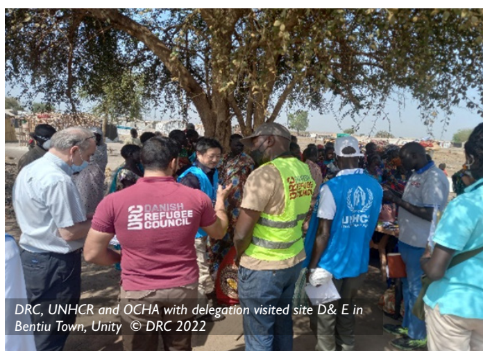
DRC, UNHCR and OCHA with delegation visited site D& E in Bentiu Town, Unity