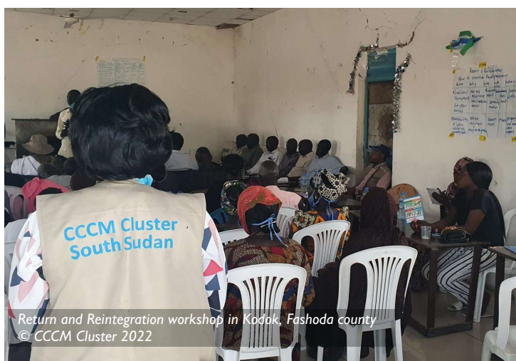
Return and Reintegration workshop in Kodok, Fashoda county