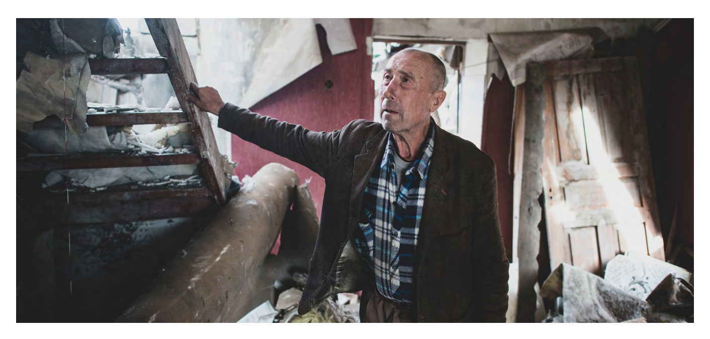
ZHOVANKA VILLAGE, DONETSKA OBLAST

An older man showing the house he had built for his children that was largely destroyed due to active hostilities.