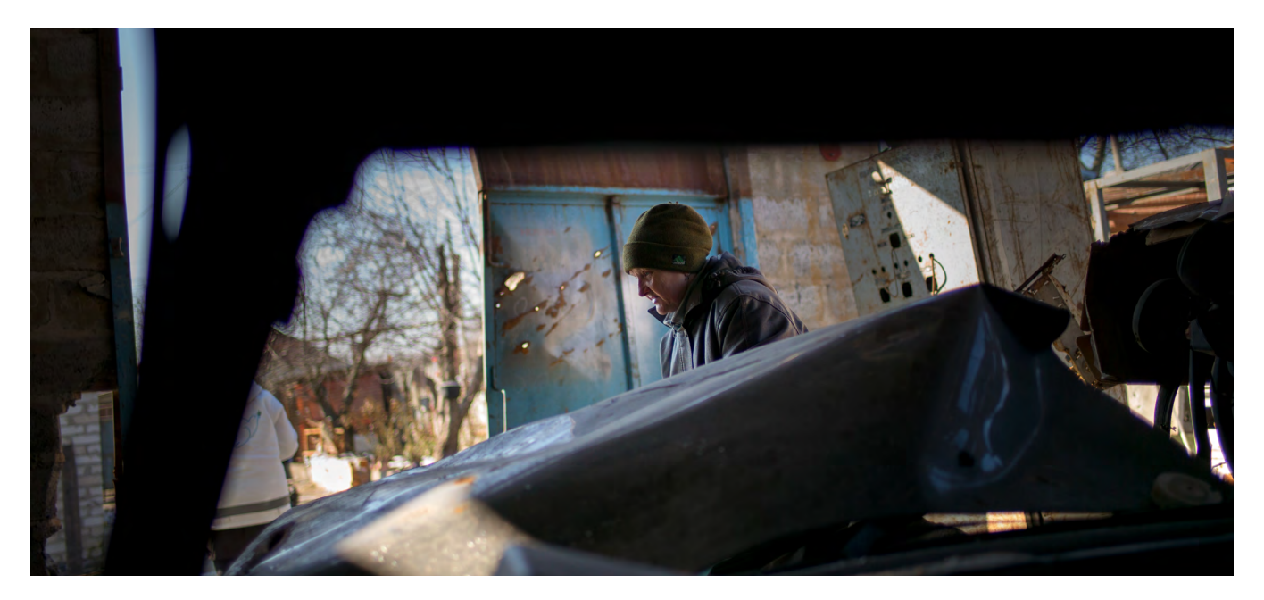
LYSYCHANSK. LUHANSKA OBLAST

An older woman standing amid debris from the nearby barn, which was heavily damaged by shelling.