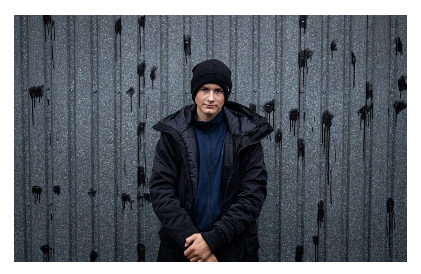
MARINKA, DONETSKA OBLAST A young boy standing next to a fence pockmarked by shrapnel.

The Protection Cluster reinforces communication with communities, IDP groups and affected population to increase partners' outreach to raise awareness and multiply information on the existing transit centres and where to find protection services, including targeted support services for GBV survivors, and humanitarian assistance; as well as so communities are able to identify and refer vulnerable people to protection partners. The GBV Sub-Cluster ensures that referral pathways for GBV survivors are developed, regularly updated and well known amongst service providers and community members. Protection partners also prioritize provision of EORE in places of arrival of IDPs, as well as in transit and collective centres.