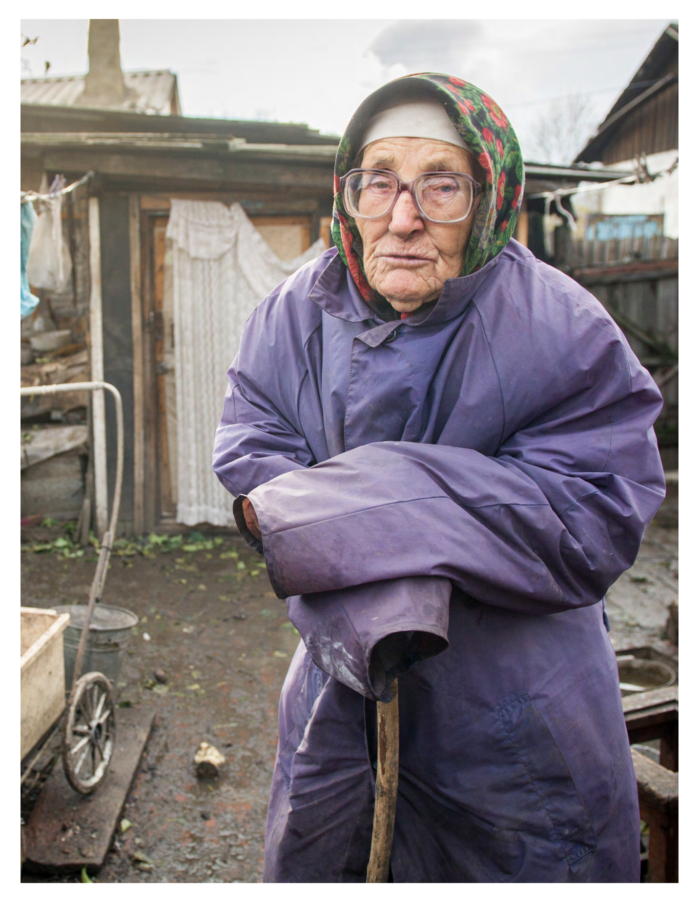
PIVDENNE, DONETSKA OBLAST

An elder woman standing in her yard, where she stores rainwater for household purposes.