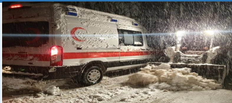
Picture: The White Helmets field team response to the snowfall in NWS

Reporting period: 01.01.2022 to 31.01.2022