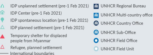
Estimated internal displacement within Myanmar Pre+Post 1 February 2021 (rounded to the nearest hundred)

The boundaries and names shown and the designations used on this map do not imply official endorsement or acceptance by the United Nations