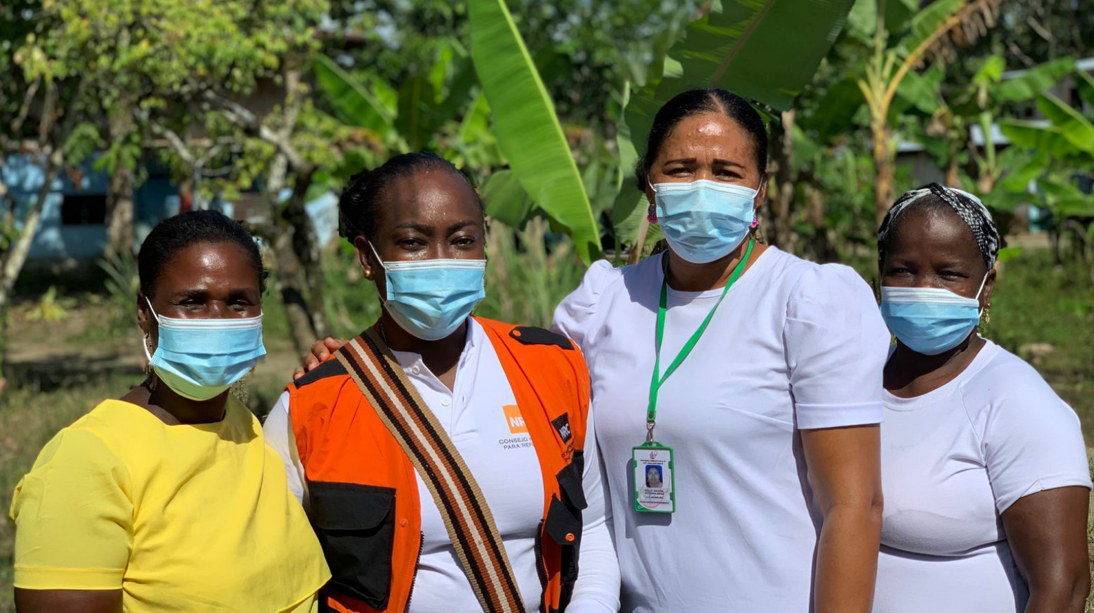
Members of the Protection Working Group in Chocó, Colombia, 2021