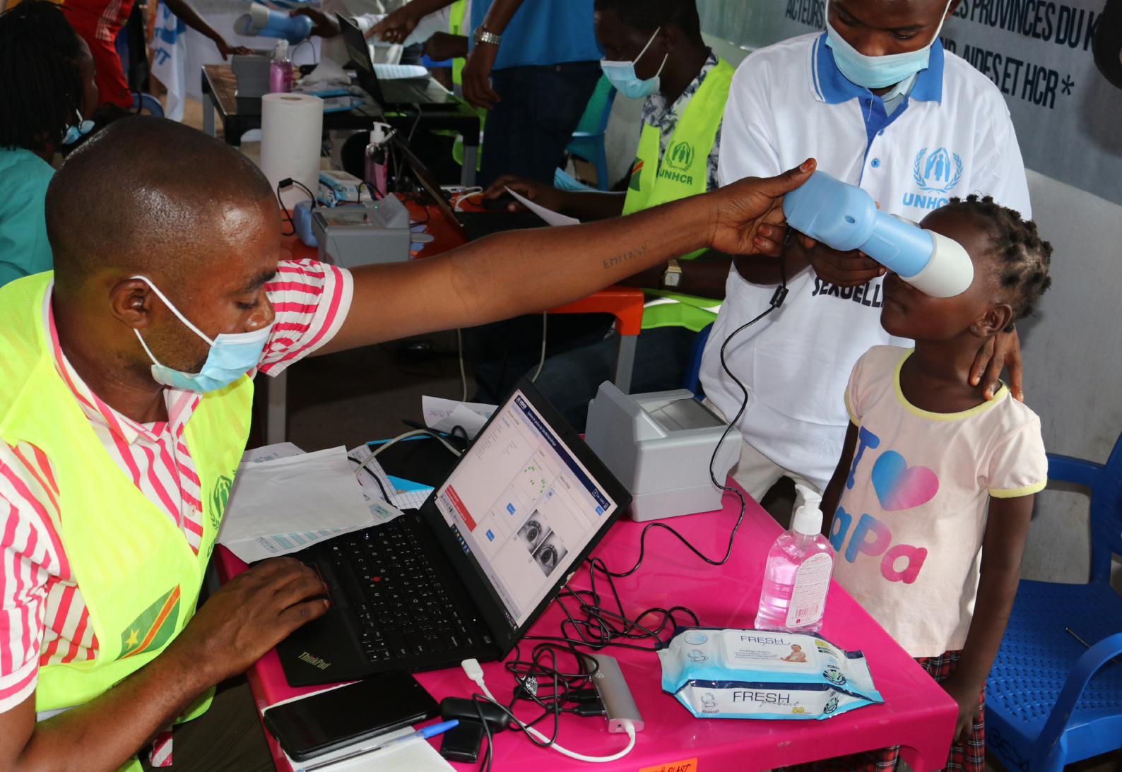
Biometric enrolment is providing additional securities to returning families in Tshikapa, Kasai Province.

biometric information of 200,000 individuals in the region, with a primary focus on internally displaced persons (IDPs) who have been forced to abandon their homesteads and livelihoods in search of security, but also includes vulnerable people in the host communities and returnees.