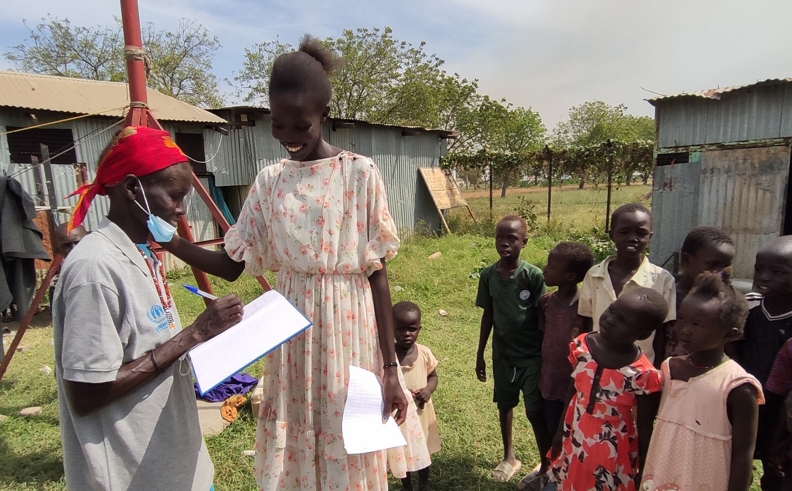
A member of a Community Action Group (CAG) conducting protection needs assessment interviews near Malakal, Upper Nile State, 2021.