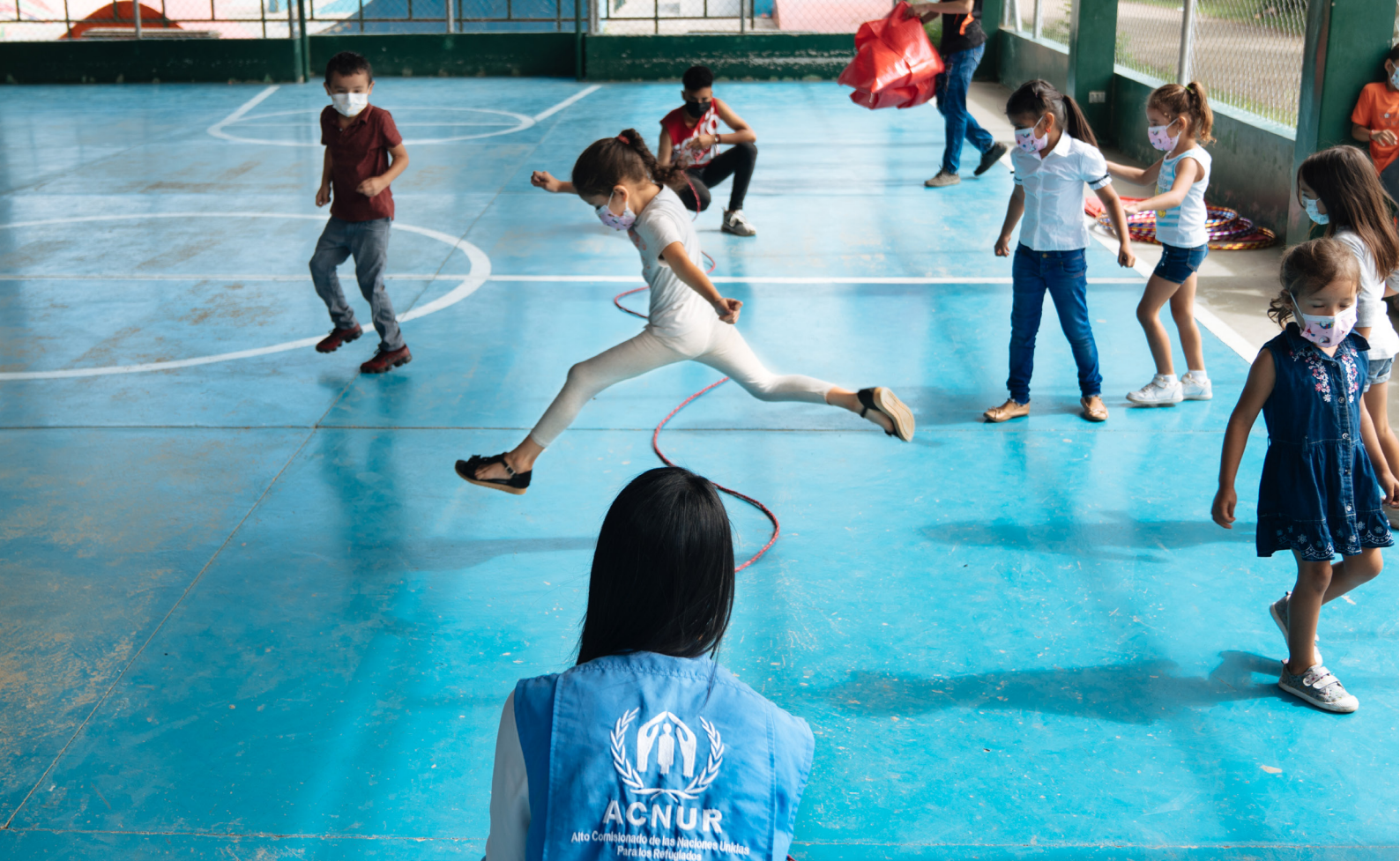
Sports and recreational activities with boys and girls at high risk of forced recruitment in the neighborhood El Paraíso in Cofradía.