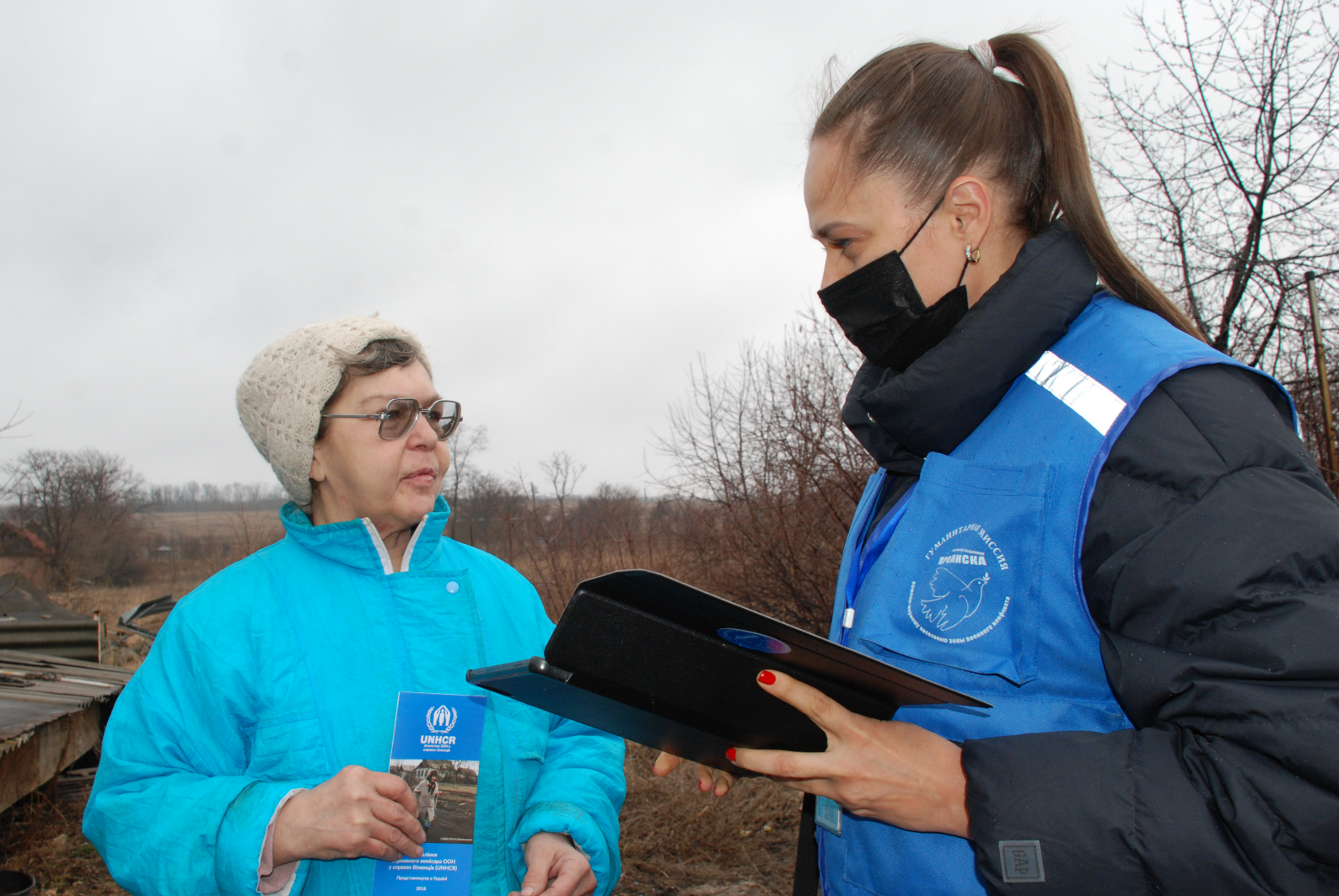
Social support specialist of the UNHCR partner NGO “Humanitarian center “Proliska - Avdiivka” conducts an interview with a resident as part of protection monitoring exercise, Novobakhmutivka village, Donetsk oblast, March 2021

multi-apartment house in the town of Vinnytsia. With the support of UNHCR, the community-based organizations now aim to replicate this experience in other regions by identifying partners among IDPs and local authorities, and advocate for the introduction of a nation-wide government supported program of cooperative housing for IDPs and local populations.