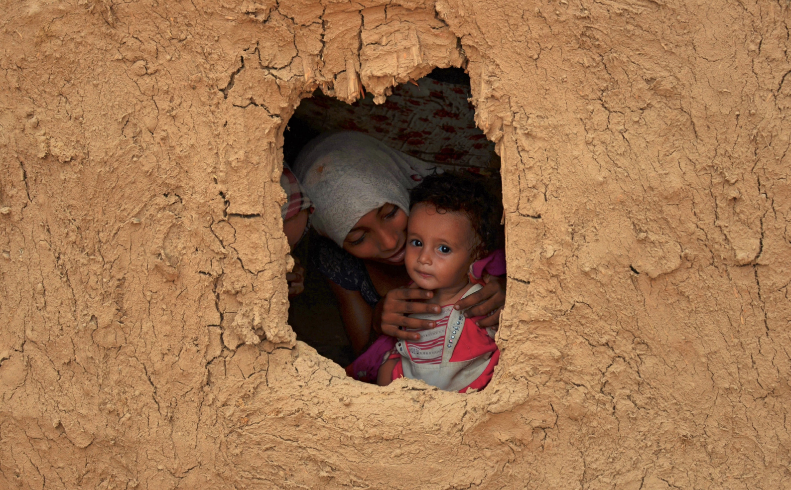
A displaced Yemeni Women and her baby in their Khazaf shelter in Al- Houdaydah Governorate, Yemen, July 2021.

CBIs for IDPs in Yemen largely consist of unrestricted and multipurpose cash assistance, with a cash transfer value in line with the Survival Minimum Expenditure Basket determined by the inter-agency Cash and Market Technical Working Group. Cash assistance is largely carried out via direct implementation modality, with UNHCR determining eligibility, supported by partners through their assessment exercises, maintaining relations with financial service providers for distribution and ensuring oversight mechanisms are in place.