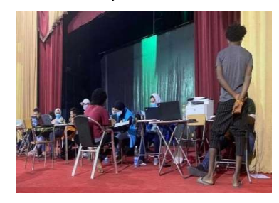
UNHCR and partners assisting individuals released from Ain Zara DC.

On 7 November, violence broke out during a demonstration outside UNHCR's main office in Tripoli. A small number of individuals in the group tried to prevent refugees and asylum-seekers from entering the premises for services. As UNHCR staff tried to negotiate access, two staff and one security guard were hit. The latter was transported to the hospital for arm injuries. UNHCR released a news statement deploring the violence. Activities at the office, housing the Registration centre, resumed after an agreement was reached with protesting asylum-seekers and refugees to provide clear passage for those with appointments to enter the premises.