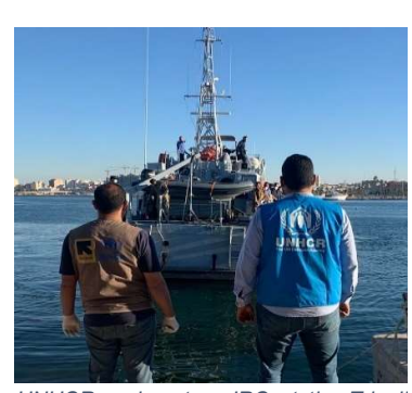
UNHCR and partner IRC at the Tripoli Commercial Port.

So far in 2021, a total of 28,636 asylum-seekers, refugees and migrants have been reported as rescued/intercepted by the Libyan Coast Guard (LCG). The last disembarkation took place on 11 November with 65 survivors, including one elderly person and two children, returned to Tripoli Commercial Port. One person has been reported missing. UNHCR and medical partner, the International Rescue Committee (IRC) provided urgent aid and medical assistance at the disembarkation point. So far this year, 206 boats have been returned; 347 persons reported missing, and 109 bodies have been recovered.