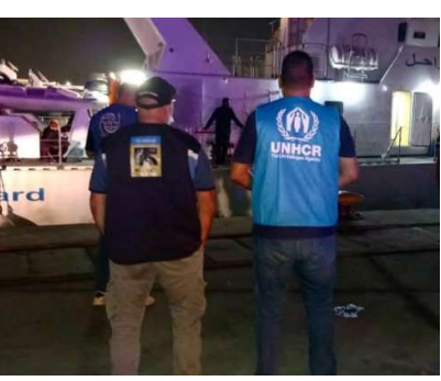
UNHCR and IRC staff providing assistance at the disembarkation point.

So far in 2021, a total of 27,551 asylum-seekers, refugees and migrants have been reported as rescued/intercepted by the Libyan Coast Guard (LCG). On 23 and 24 October, two disembarkations took place in Tripoli Naval Base (TNB) and Tripoli Commercial Port (TCP) respectively. A total of 177 individuals were returned, including 24 women and seven children. UNHCR and medical partner, the International Rescue Committee (IRC), were present at TCP to provide urgent aid and medical assistance. IRC provided emergency assistance at the TNB. All