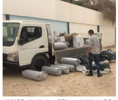
UNHCR distributing CRIs and HKs in DCs.

On 27 October, a young male Eritrean asylum-seeker died in Tripoli. According to reports received, he was hit by a car outside the CDC. The incident was reported through a UNHCR partner emergency hotline and a medical team was deployed. He was taken to hospital but passed away shortly afterwards. UNHCR issued a news statement calling for an investigation into the circumstances surrounding the incident.