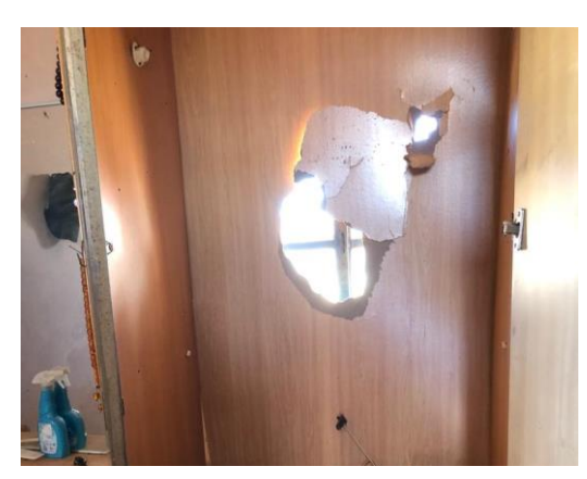
Damaged door from Umm Fagarah settler attack.

The high casualty rate continued in the West Bank in September, with ten Palestinians, including one child, killed by Israeli forces. Six Palestinians were shot and killed by Israeli forces in exchanged-of-fire incidents in Beit 'Anan village (Jerusalem) and Birqin village (Jenin), in the context of search-and-arrest operations in the two villages. Two other Palestinians were shot in the Old City of Jerusalem while stabbing or allegedly trying to stab Israeli forces. On 24 September, a Palestinian protester was shot and killed during ongoing protests in Beita village (Nablus) against the establishment of a settlement outpost. Since these protests began in early May 2021, eight Palestinians have been killed and over 4,450 injured, including 182 by live ammunition and 855 by rubber bullets.