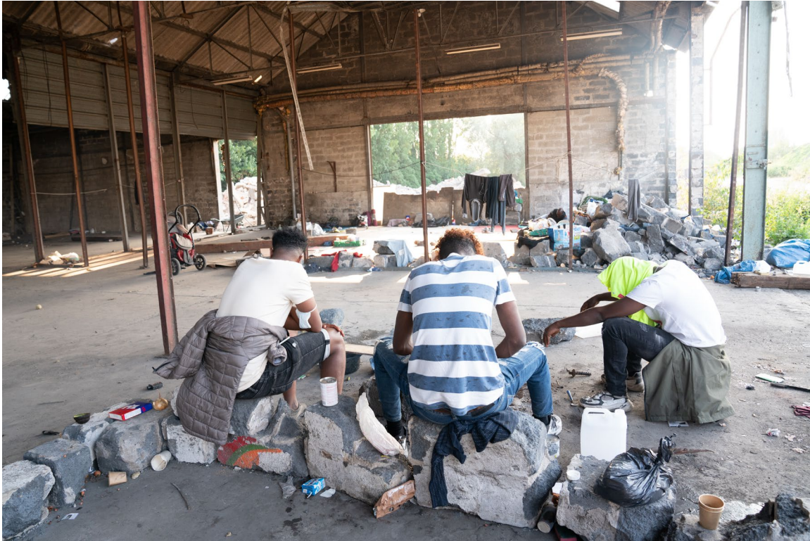
Three boys from Mali sit at the disused warehouse where they spent their nights, Calais, France, July 2021.