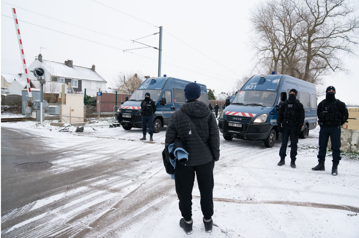
A 15-year-old Afghan boy holds his blanket during a routine morning eviction of the migrant encampment where he sleeps, February 2021.

As the French Defender of Rights has concluded, the evictions are carried out with the primary purpose of forcing people to move elsewhere and do not serve to resolve people's migration or housing status.