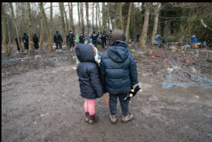
Two children watch as police seize their tent during an eviction of a migrant encampment in Grande-Synthe, northern France, January 21, 2021.

The United Kingdom should develop safe and legal means for migrants in France, elsewhere in the European Union, and other countries to travel to the United Kingdom to seek safe haven, reunify with family members, or work or study.