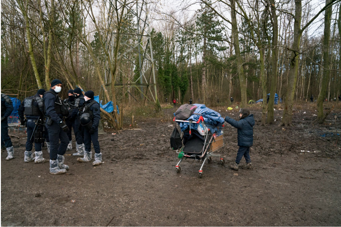
During an eviction of the Grande-Synthe migrant encampment, a child holds on to a shopping cart containing the tent he and his family use for shelter, October 2020.

Aggressive policing of aid groups reinforces these impediments to humanitarian aid. Volunteers with Utopia 56, a group that carries out regular rounds in Calais and Grande-Synthe to connect new arrivals and others with emergency shelter, health care, and other essential services, are regularly stopped for identity checks and frequently fined for minor vehicle and traffic infractions—low tire pressure, chipped windscreens, failing to signal sufficiently in advance before turning, crooked parking, and the like. “The amount is always 135 euros, the highest fine for these supposed offenses,” said Antoine Nehr, a coordinator for Utopia 56 in Calais.