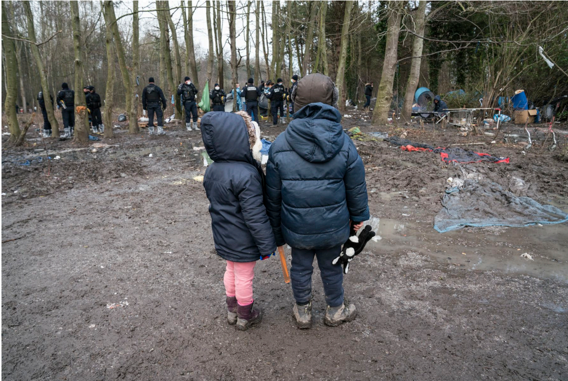
Two children watch as police seize their tent during an eviction of a migrant encampment in Grande-Synthe, northern France, January 21, 2021.

Police also carry out periodic mass evictions that remove everybody from an encampment. During these mass evictions, most people are forced to go to a reception center (officially, a “reception and assessment center,” centre d'accueil et d'évaluation des situations administratives , or CAES), where they usually are able to stay no more than a few days.