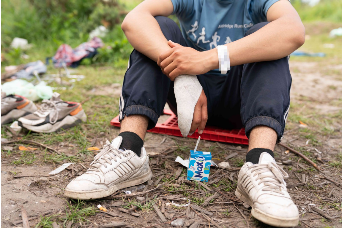
A 15-year-old Afghan boy at a migrant encampment on the outskirts of Calais, northern France, July 2021.

In addition, during periods of restrictions on movement in response to the Covid-19 pandemic, Utopia 56 volunteers received more than 90 citations for alleged violations of the curfew and other limits on movement—even though they carried documents showing that they were carrying out activities that were exempt from these restrictions.