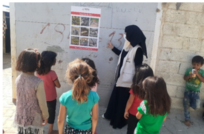
An awareness session on explosive remnants of war (ERW).

UNHCR's protection partners conducted awareness raising and psychosocial support sessions, identified cases and referred them to basic services in Idleb and Aleppo; such community-based protection interventions reached 9,349 people in August. In addition, over 1,300 displaced and vulnerable people received protection services such as awareness raising on civil status documentation and housing, land and properties, legal consultation and assistance.