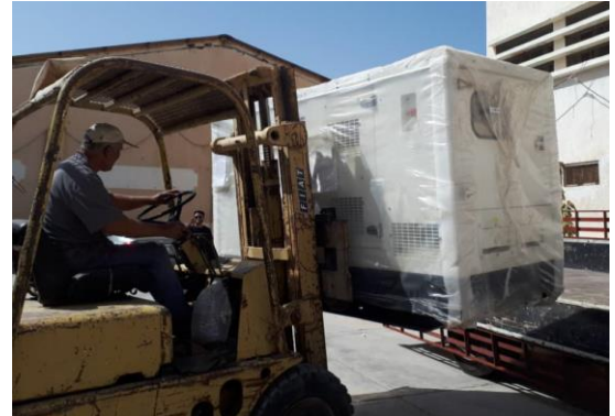
Installation of a new generator at LKC

Special thanks to our major donors: Canada | European Union | Germany | The Hellenic Republic | The Holy See | Italy | Luxembourg | The Netherlands | Norway | United Kingdom | United States of America | Other Private Donors .