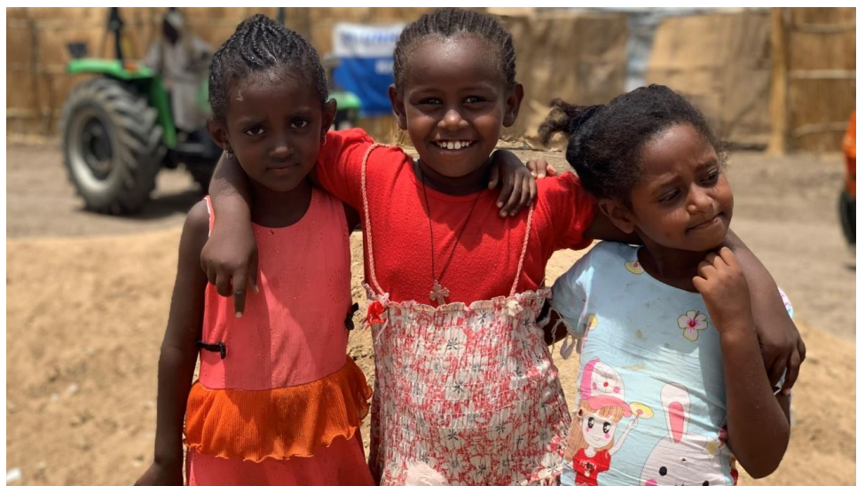
Refugee children at Hamdayet, Transit Centre (Kassala State), one of Ethiopia-Sudan crossing points.