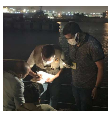
IRC providing medical assistance at the Tripoli Naval Base.. ©UNHCR

So far in 2021, a total of 24,420 refugees and migrants have been reported rescued/intercepted by the Libyan Coast Guard (LCG). On 21 September, a total of 42 individuals (including eight women and four children) disembarked at the Tripoli Naval Base. The group initially embarked from Zliten (160 km east of Tripoli). UNHCR and medical partner, the International Rescue Committee (IRC), were present at disembarkation to provide urgent medical assistance and Core Relief Items (CRIs).