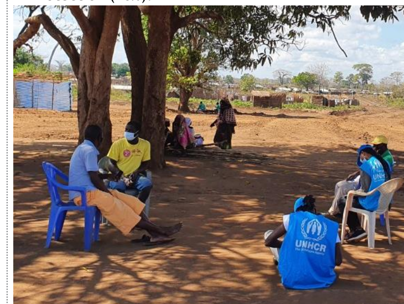
Community Engagement Activity/Nanjua A Relocation Site 2021

Most of the cases were related to the NFI sector (42.7%) and FSL sector (19%) followed by General Protection (10%).