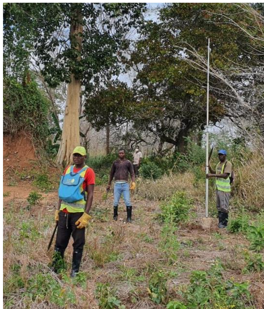
Site demarcation/ Corrane Relocation Site Photo/IOM/ 2021

In 25 de Junho temporary sites, the site map was finalized for the expansion area, including a total of 570 plots available; 210 plots have been already cleaned.