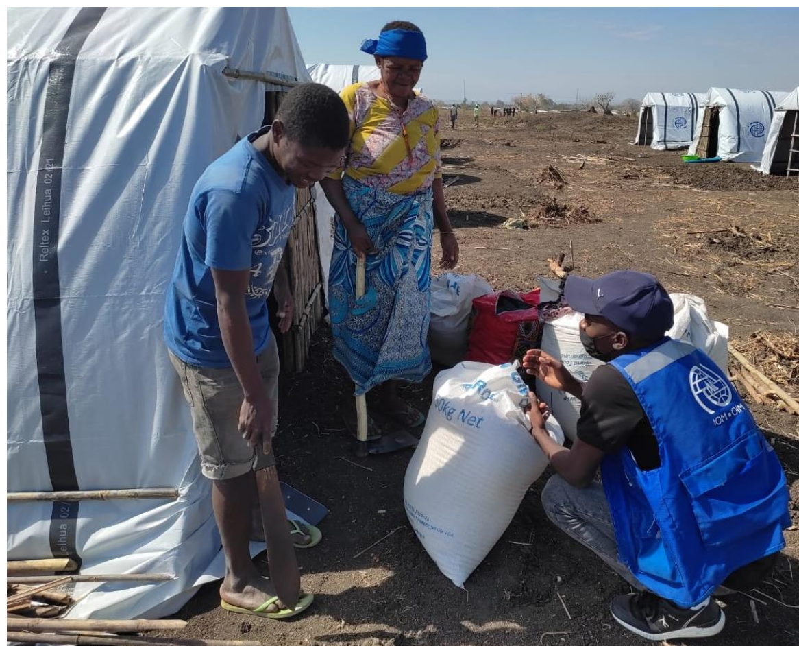
Relocation/25 de Junho Extension Relocation Site Photo/IOM/ 2021