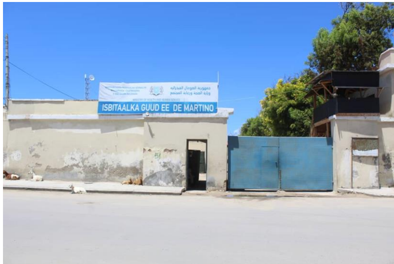
← De Martino, the only hospital in Mogadishu where all COVID-19 related cases were managed during the first wave of the pandemic in early 2020. Mogadishu, Somalia.

Twenty-five health workers told Amnesty International that the government was caught off-guard by the pandemic and that there were no testing and treatment capabilities. 62 The government had in March 2020 set-up De Martino Hospital in Mogadishu as the only health facility to manage COVID-19 cases in the country. Four health workers who were first responders at the hospital said they lacked basic equipment and essential medications such as ventilators and oxygen supply to treat infected patients. 63 It took until July before the government opened a second COVID-19 quarantine centre at the Banadir Hospital in Mogadishu. 64