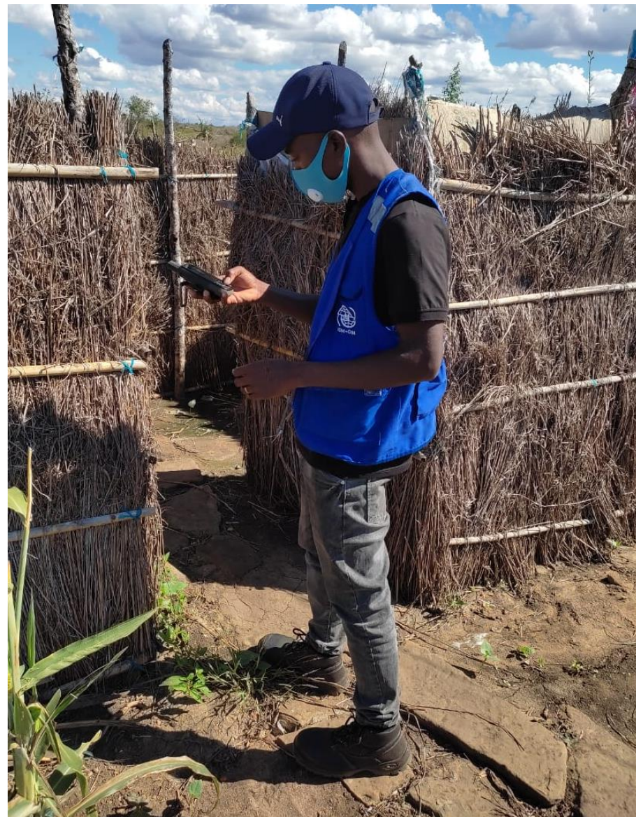
Field data collection/ 25 de Junho Temporary Site Photo/IOM/ 2021

In order to support the local authorities to manage of the influx of displaced people to Montepuez, CCCM partners have been doing site clearance, and plot demarcation and allocation in Montepuez, in the sites of Ujama (798), Mararanje (548), and Mirate (355), totalling 1,737 plots.