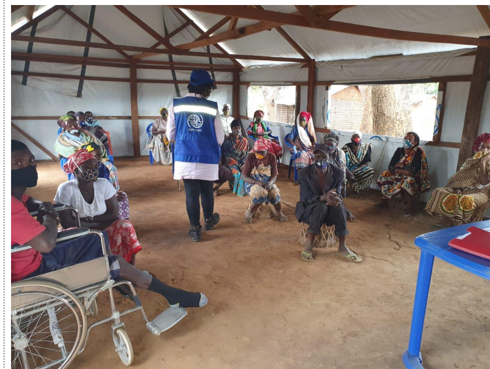
People with Disabilities Focus Group Discussion 2021

Disability inclusion committees have been set up in Ngalane and Ntocota and are meeting on a regular basis. The committee gives members a chance to discuss with CCCM and other partners and suggest ways to improve accessibility and service delivery in the sites.