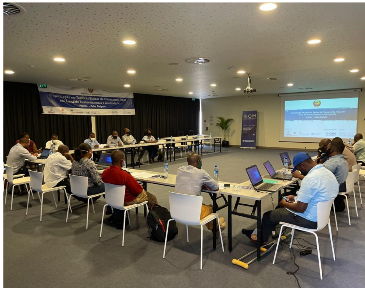
Site Planning Capacity Building Training with Government Counterparts Photo/IOM/ 2021