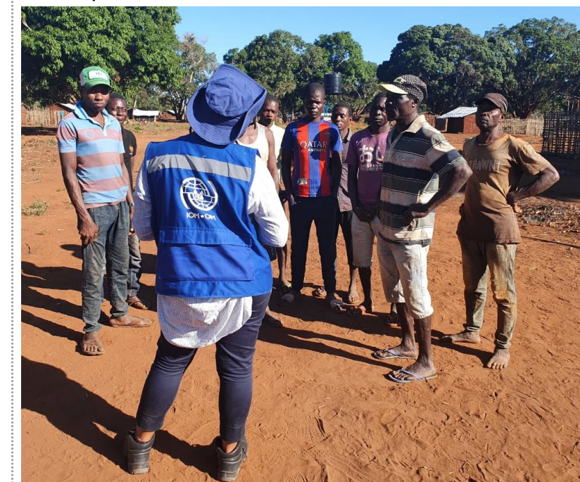
Community Consultation Photo/IOM/ 2021

In Montepuez, thanks to complaints gathered at site level through the CFM and liaison with Committees, an additional 45 vulnerable families were identified for specific assistance.