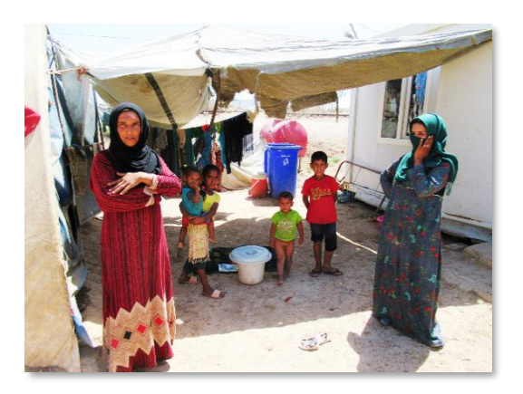
IDPs near the former Balad train station informal site, Salah Al-Din

In June 2021, OCHA coordinated a key inter-agency mission to Salah Al-Din, providing coordination and logistics to a protracted displacement site in Balad, which has experienced long-standing challenges for humanitarian access.