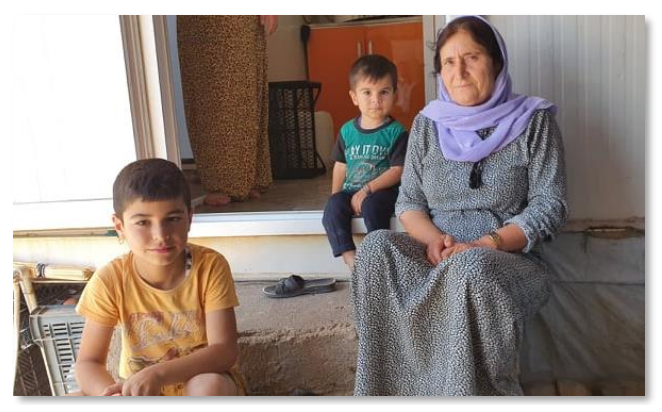
Sinjari family displaced in Mamrashan IDP camp (2021)

In June 2020, the Iraq Inter-Cluster Coordination Group (ICCG) published a Situation and Needs Monitoring Report, evaluating the implementation of the humanitarian response in Iraq between January - May 2021, and taking stock of the changing operational context in Iraq during this period. Its analysis summarizes key trends and changes in the humanitarian situation and evolution of needs based on available data provided by the clusters.