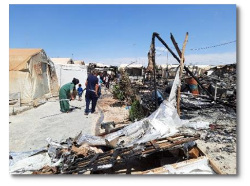
Fire destroys part of Shariya IDP camp on 4 June 2021, Duhok Governorate