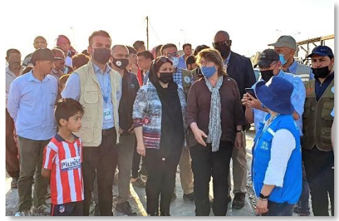
Humanitarian Coordinator Visit to Shariya Camp

A major fire broke out in Duhok Governorate's Shariya IDP camp on 4 June 2021, destroying nearly 300 tents and affecting 1,400 people. Twenty-five people suffered minor injuries and were treated in the camp's clinic and eight people received medical assistance in the hospital and were discharged that evening. Affected families were transferred to the camp's school and other public spaces in the camp, with another 30 families transferred to nearby public buildings. Partners and authorities distributed water, food, non-food items (NFI), clothing, tents, COVID-19 prevention items, and provided psychosocial support. In the week following the fire, partners registered those whose civil documents such as birth certificates were destroyed, with the Ministry of Interior later travelling to Duhok to process applications for replacement documents.