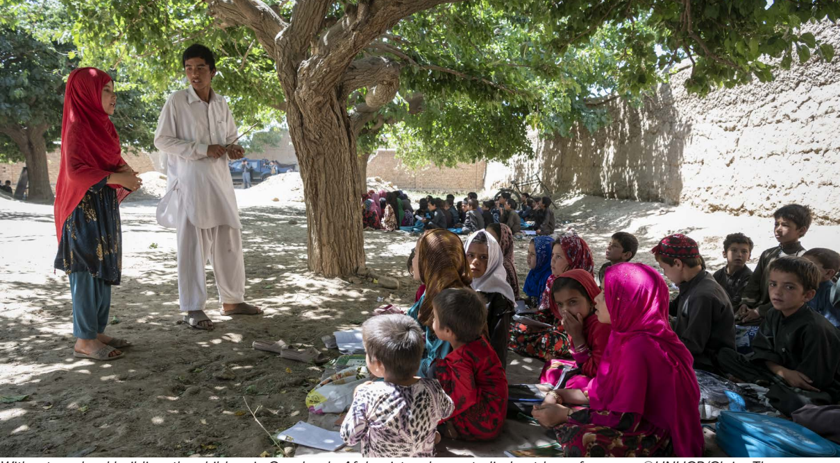
Without a school building, the children in Qarabagh, Afghanistan, have studied outdoors for years.

Many host communities also lack the capacity to support the inclusion of refugee children, through, for example, catch up, remedial, or accelerated education programmes. Some States also do not have resources to establish a support system such as extra local language classes or supplementary classes for children whose education was interrupted, or may not even have a policy in place to facilitate the inclusion of refugee children into the education system.