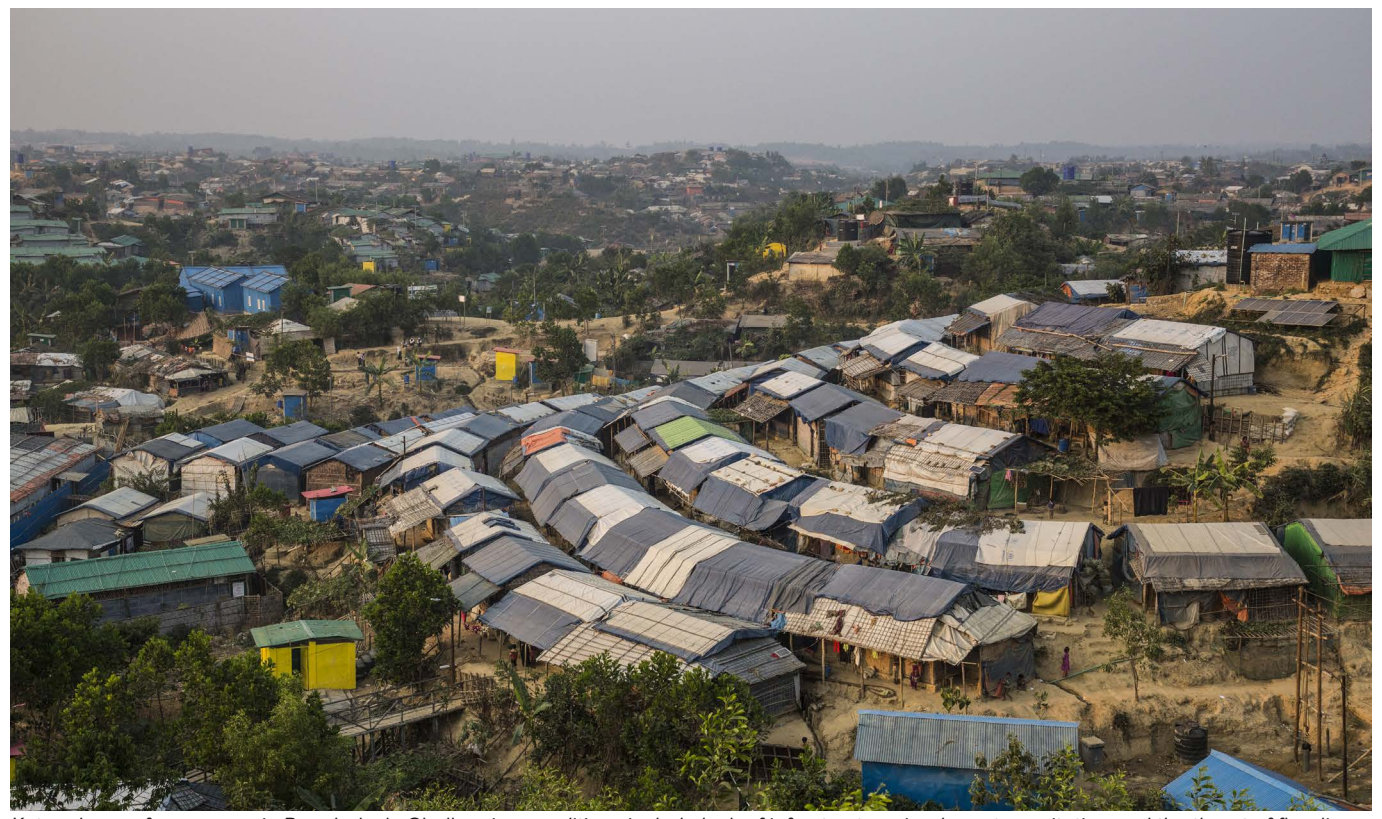
Kutupalong refugee camp in Bangladesh. Challenging conditions include lack of infrastructure, inadequate sanitation and the threat of flooding and landslides. Half of the camp population are children under the age of 18 years.

Across the region, there are over 1.6 million refugees or other persons of concern to UNHCR living in camps or camp-like situations, and delivering education in these locations remains challenging. The refugee camps in Cox's Bazar in Bangladesh host more than 850,000 refugees. The Government of Bangladesh provided land and is supporting the refugees with various services, but due to the population density, living conditions in the camps remains fragile. School structures are often very basic, with minimum furniture and insufficient school supplies, and classes are provided in an informal and limited manner.