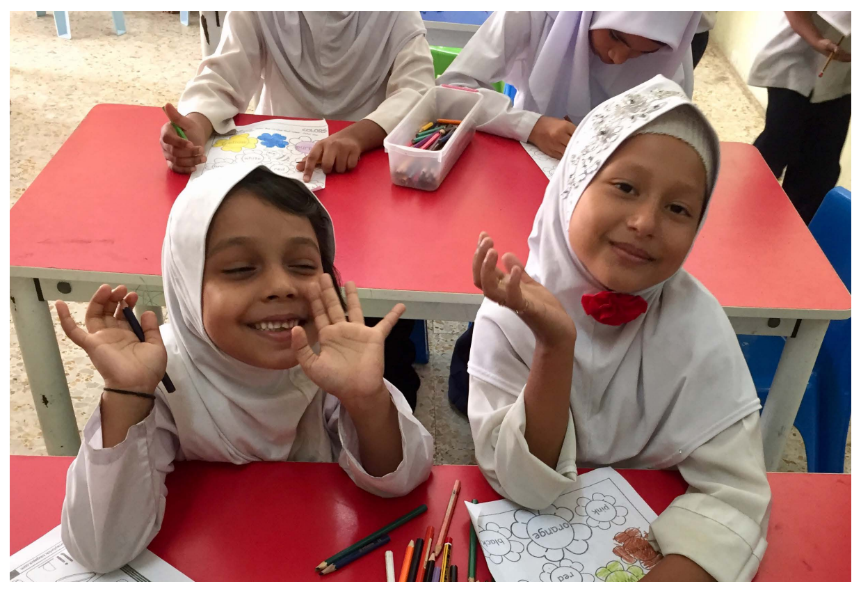
Malaysia. Girls enjoy studying at a learning centre run by UNHCR in collaboration with partners and refugee communitie

Support to returnees is also important. In Afghanistan, as the number of Afghans returning to their areas of origin increases and host communities require assistance, as part of the Priority Areas of Return and Reintegration (PARRs) programme, several projects for the construction or rehabilitation of school facilities have been implemented. Last year, 21 projects were completed benefitting over 56,000 people and more are planned for this year.