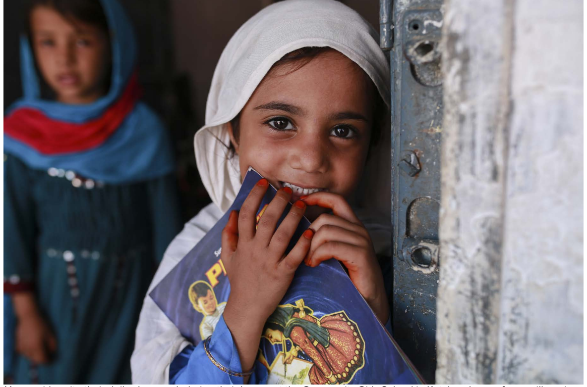
Young girls write their daily class work during their lesson at the Community Girls School in Kotchandana refugee village in Punjab province of Pakistan.

UNHCR is also part of the Association of Southeast Asian Nations (ASEAN) Working Group for Strengthening Education for Out-of-School Children and Youth which seeks to understand and address some of the barriers to accessing education in the region.