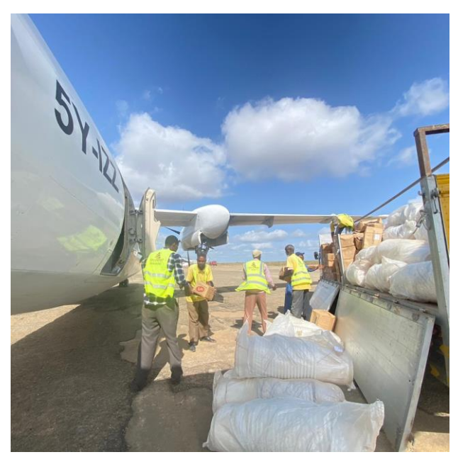
Humanitarian supplies arriving to Hudur.