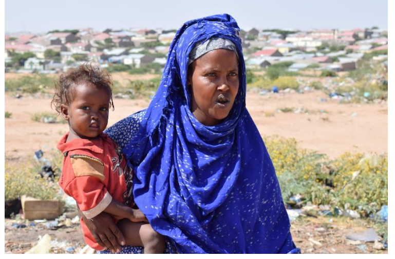
Drought conditions expose girls and women to increased risk of abuse and harassment.

"Women in Somalia have reported increased awareness of sexual and gender-based violence in the community through community mobilization and sensitization on protection risks and available response /reporting mechanisms in IDP sites," said Madhumita Sarkar, Senior GenCap Advisor, Somalia. "Men are also suffering in silence, and we are always leaving them out. There is a need to work with them."