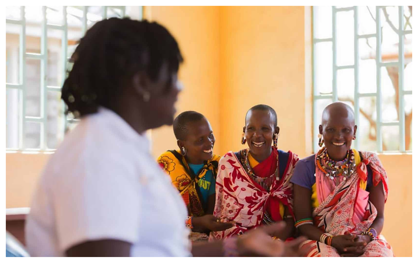
© SRHR Initiative in WHO/AFRO- Issue 001 - May 2021

Sexual and Reproductive Health and Rights in the WHO African Region