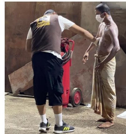
Partner IRC providing urgent medical assistance at a disembarkation point.

UNHCR's Chief of Mission completed a one-week mission in Benghazi, made jointly with the WFP Country Director. During the week, the mission was able to visit Al Haleis Tawerghan internally displaced persons' (IDP) settlement, the biggest in east, where they met with IDPs and the camp's management. There was also an opportunity to attend LibAid's distribution of CRIs and hygiene kits to 20 families (137 individuals) of Murzug IDPs hosted in Benghazi (with 486 families/2,785 Joint distributions with LibAid, WFP and UNHCR in Eastern individuals reached in this distribution campaign). On the same day, WFP