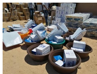
CRIs for IDPs near Tawergha, central Libya.

On 14 June, UNHCR with partner LibAid and the Libyan Scouts distributed CRIs to 67 IDP families in Abogren and Alwashka (east of Tawergha) . The IDPs are from several different areas of Libya, having arrived over multiple years.