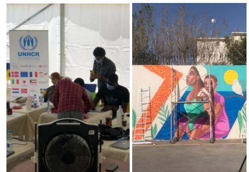
WRD workshop started on 14 June with local artists and refugees coming up with ideas for a mural at UNHCR's office.

Starting 14 June , and with World Refugee Day (WRD) approaching on 20 June , UNHCR has been collaborating with a local organization and partner IRC to host a four-day workshop at the Community Day Centre in Tripoli . Eight refugees have been taking part in the workshop where they came up with a mural design, aided by three Libyan artists. The mural is being executed at UNHCR's new premises and represents this year's WRD theme of inclusivity. Another event is taking place on 18 June with the Libyan Scouts, bringing together internally displaced persons (IDPs) and refugees for a day of entertainment and awareness. Finally, UNHCR's Benghazi Field Office is coordinating an event where the spotlight will be on the Tawergha IDPs and their cultural heritage, handicrafts, and culinary talents. UNHCR's Chief of Mission is expected to attend this event to reinforce UNHCR's commitment to supporting Libyan displaced communities.