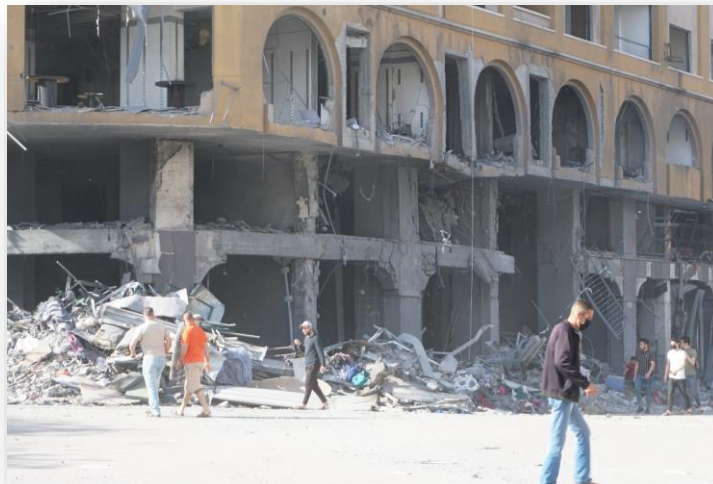
Gaza, 12 May 2021.