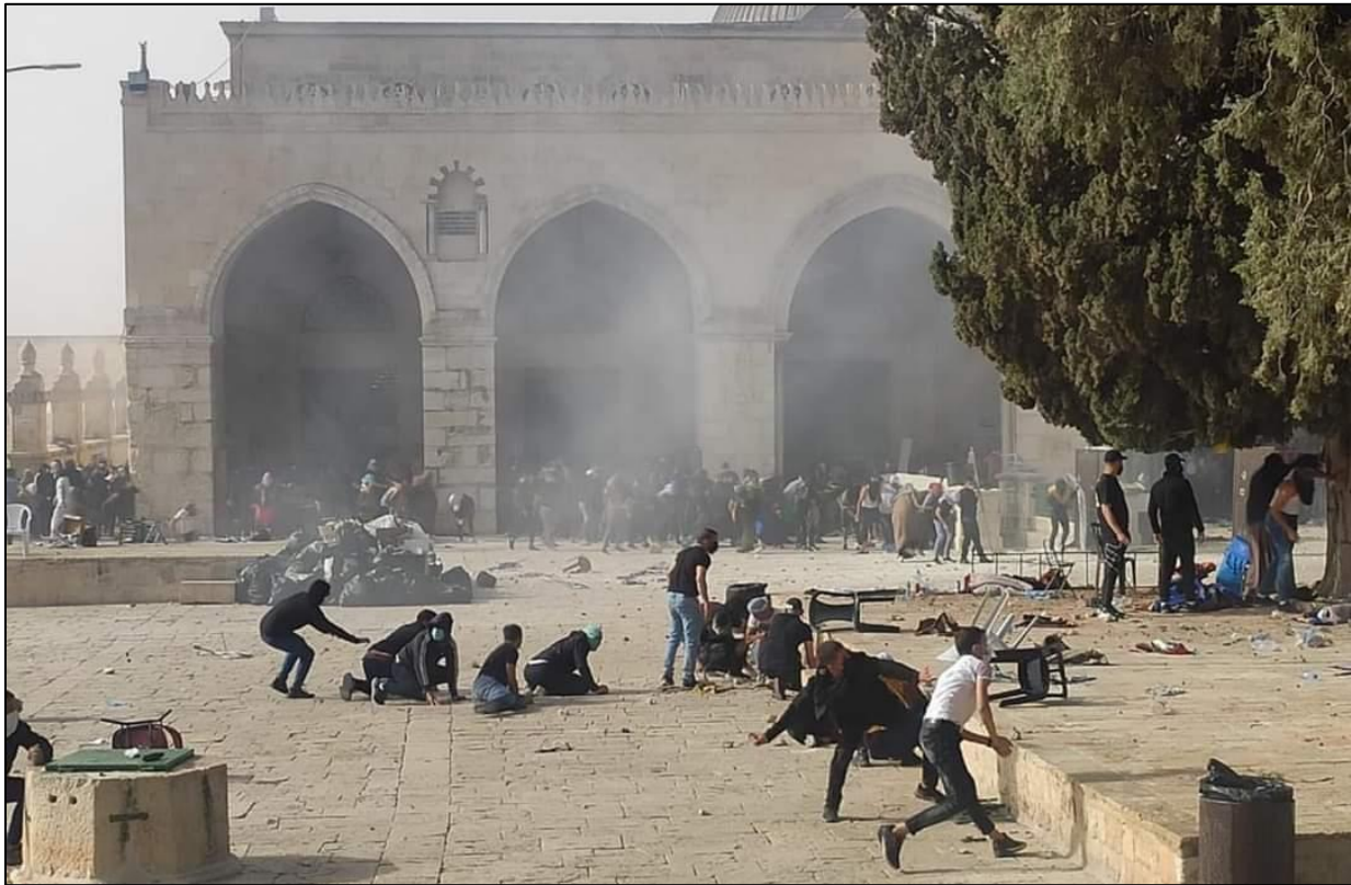
Clashes at the Al Aqsa Mosque, 10 May 2021.

Between 7 and 10 May, widespread clashes erupted in East Jerusalem, particularly in the Al Aqsa Mosque, and the Damascus Gate area. A heavy Israeli security presence and large numbers of worshippers contributed to the tensions. On 10 May, 657 Palestinians were injured, mostly in the upper bodies, with at least one Palestinian losing his eye. According to Israeli media and Israeli police report, 32 Israeli officers were reportedly injured on 10 May, of which 21 were in the Al Aqsa compound.