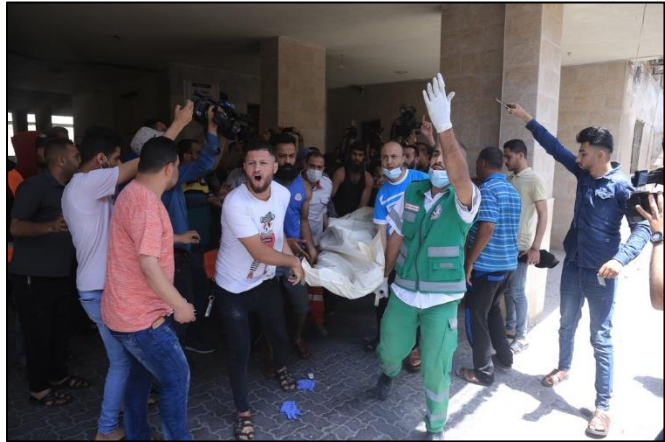
Casualties following airstrike on Gaza, 11 May 2021.

Gaza: MoH hospitals are properly managing patients. PRCS allocated dedicated ICU beds in Al Quds Hospital (Gaza City) and Amal Clinic (Khan Yunis), deployed Pre-Triage tents as preparedness measures, and set up TSPs in Jabalia, Deir Al Balah and Rafah. No specific needs have been identified, as yet.