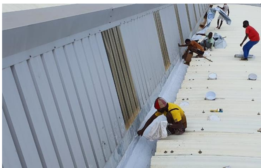
Repairing roof at transit centre, Pemba Photo/IOM/ 2021