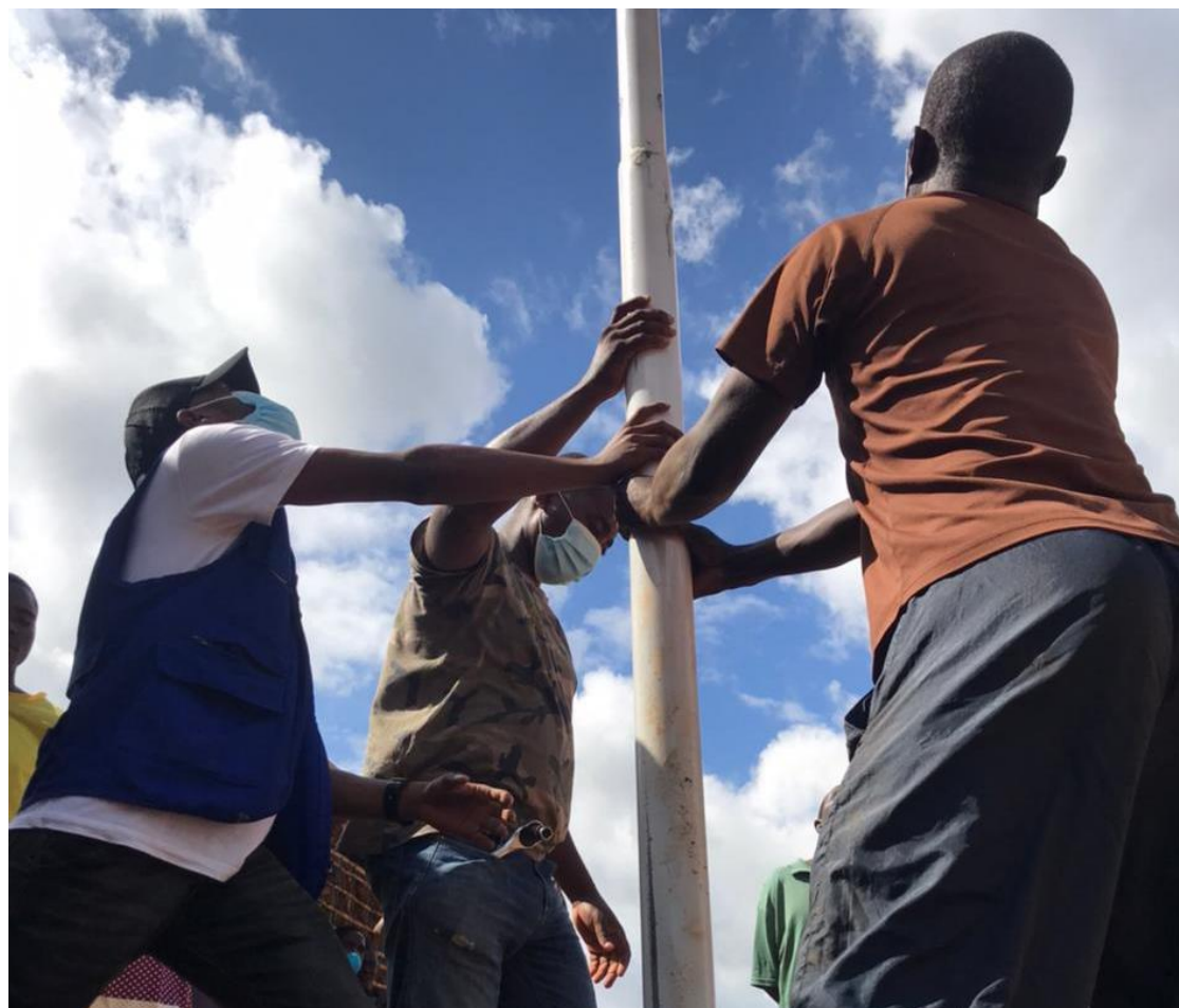
Installation of solar street lights in Marakoni Photo/IOM/ 2021