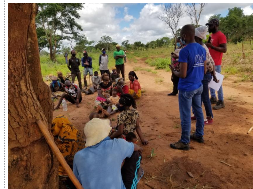
Meclulani Relocation plot allocation 2021