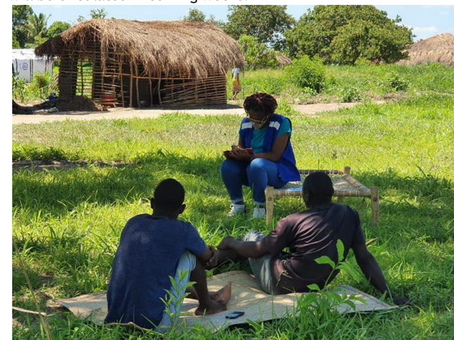
Nanglane Relocation Site

CCCM is working closely with the disability working group to ensure operations include a lens of inclusivity. This includes developing guidelines to engage with persons with disabilities through community governance structures as well as monitoring activities against the Camp Management Standards Disability Inclusion Checklist. A report on findings will be circulated in coming weeks.