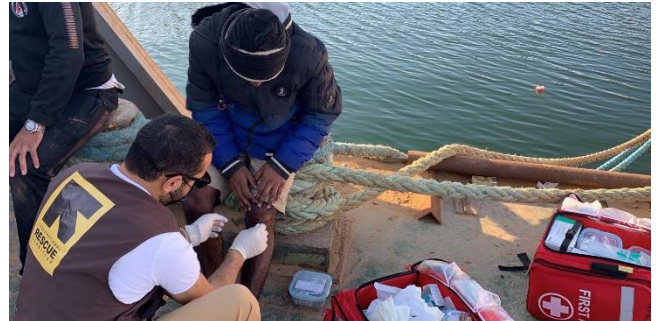
UNHCR's medical partner IRC providing assistance at the disembarkation point in Tripoli.

As of 19 May, a total of 6,753 refugees and migrants have been registered as rescued/intercepted by the Libyan Coast Guard (LCG) and disembarked in Libya in 2021. On 17 May, more than 250 individuals disembarked at the Tripoli Naval Base. UNHCR and its medical partner, the International Rescue