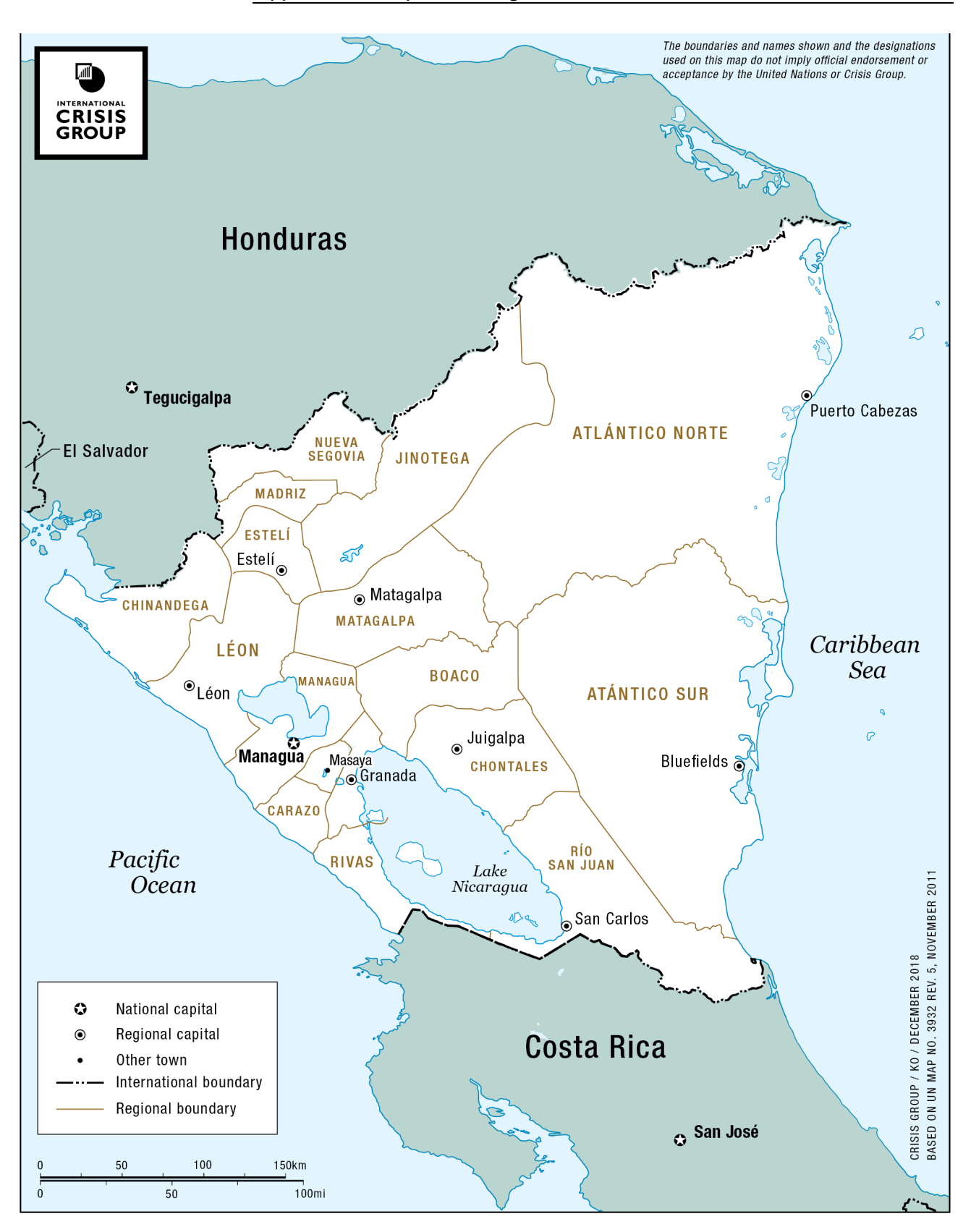
Appendix A: Map of Nicaragua