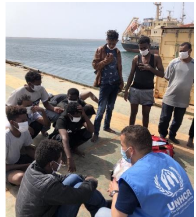
Disembarkation in Tripoli.

As of 9 May, a total of 6,270 refugees and migrants have been registered as rescued/intercepted by the Libyan Coast Guard (LCG) and disembarked in Libya in 2021. Additionally, on 10 May, around 600 people were intercepted at sea by the LCG and returned to Tripoli and Zawiya. UNHCR and its medical partner, the International Rescue Committee (IRC), were present at the disembarkation points to provide urgent medical assistance and core relief items (CRIs) before individuals were transferred to detention centres by the Libyan authorities. Another two boats capsized off the coast of Libya on Sunday and Monday, leaving scores of bodies washed ashore and at least two dozen people presumed dead.