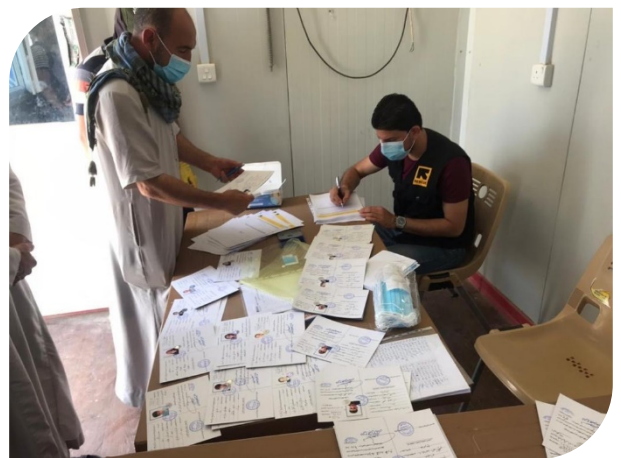
Distribution of civil documents through mobile missions in Anbar 2021

At the field level, UNHCR and partners have continued to support mobile missions organized through local CADs. In Ninewa , UNHCR and partners continued to support mobile missions being undertaken by the local CAD to Salamiyah and Jeda'a camps with a focus on expediting the distribution of documents to IDPs prior to their departure from these camps. Between January and March 2021, 994 Civil Status IDs (CSIDs – 165 in Salamiyah camp and 829 in Jeda'a camp) were distributed, and 37 Iraqi Nationality Certificates (INCs) were issued and submitted to beneficiaries in Jeda'a camp. In total, 11 CAD missions were coordinated in Jeda'a camp by UNHCR and partners. In Anbar , UNHCR continued to strengthen cooperation with the local CADs by organising mobile missions to IDP camps and informal sites to support the processing of core civil documentation for the most vulnerable IDPs, without them having to visit civil affairs offices. As a result, 88 INCs were issued to IDPs in AAF camp, and 77 INCs were issued to IDPs in the low-cost housing site (which hosts IDPs from areas of no return - Jurf al Sakhar and Al Ewesaat ).