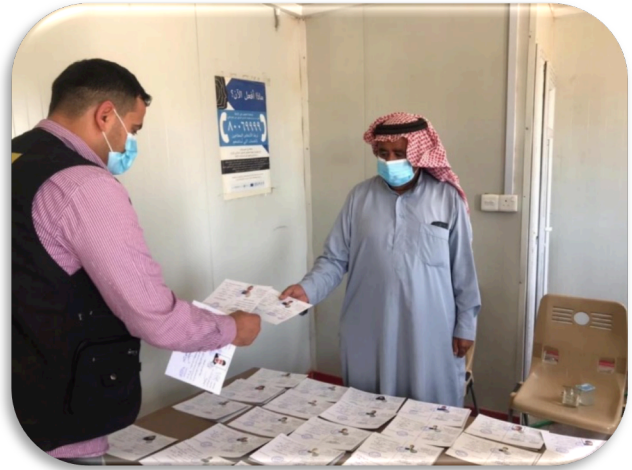
Issuance of civil documentation in Anbar 2021

In response, UNHCR, in cooperation with government and civil society partners, implements and supports projects and initiatives to enable IDPs and returnees to access civil documentation.