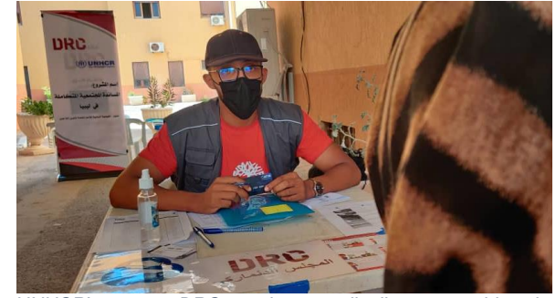
UNHCR's partner, DRC, continues to distribute pre-paid cash

UNHCR's partner, CESVI provided cash assistance to 49 refugees included which regular cash assistance to three individuals and emergency cash assistance to 46 individuals. Some 18 per cent of those receiving assistance suffered physical disability impairment while 9 per cent are diagnosed with chronic diseases. For IDPs, partner, the Danish Refugee Council (DRC), distributed cards to vulnerable IDP households.