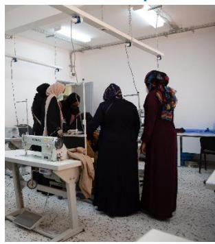
At the Women Empowerment Centre in Tripoli.

At the Women Empowerment Centre in Tripoli, UNHCR is coordinating initiatives that support both refugee and Libyan women. There are several courses, including sewing, first-aid, make-up, and language courses. Such practical activities can have a real impact on lives through broadening socio-economic opportunities.