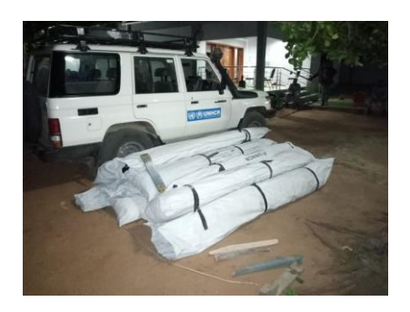
UNHCR provided ten tents to set up a transit centre to process families arriving by boat from Palma at Pemba's port