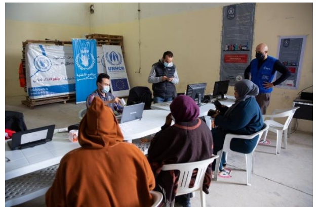
UNHCR and WFP conducting food-parcel distributions in Tripoli.

During the reporting week, UNHCR's partner, CESVI provided cash assistance to a total of 146 refugees and asylum-seekers (67 families) living in the urban community in Tripoli. This included regular cash assistance to 23 individuals (four families) and emergency cash assistance to 123 individuals (63 families). Partner, the Danish Refugee Council (DRC), provided pre-paid cash cards to 145 internally displaced families in Al-Riyayna (160 km south-west of Tripoli). In the east, partner, ACTED distributed pre-paid cash cards to 441 displaced families including 307 families in Benghazi and 134 in Sebha.