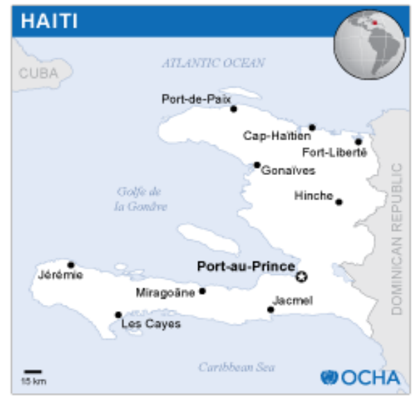
The boundaries and names about and the designations used on this map do not imply official endorsement or acceptance by the United Nations. Map created in Sep 2013.

There are unconfirmed reports that two spontaneous sites are being established in the Vallée de Bourdon. One of the priorities will be to confirm this situation and assess the number of individuals and immediate needs in these sites.