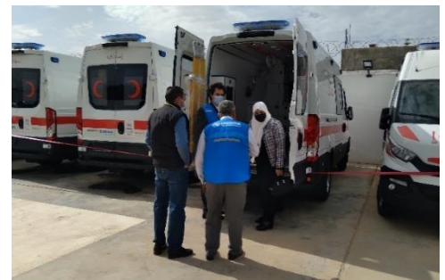
UNHCR supports local healthcare centres and organizations with assistance that has included 15 ambulances to municipalities across Libya.

This week marks one year since coronavirus (COVID-19) was officially recorded in Libya. The first case of COVID-19 was reported on 24 March 2020; since then, more than 156,000 cases have been recorded. With a huge strain placed on Libya's health services, UNHCR's COVID response initially focussed on the health sector. In response to shortages of basic equipment and medicines and to help stem the increase in infection rates, UNHCR and partners supplied 15 ambulances to various municipalities, hygiene kits, soap, PPE, blankets, sanitary cloth for hospital bedding, and tents, as well as 13 generators. The provision of 14 prefabricated containers, to be used as COVID-19 testing and reception facilities at Misrata, Benghazi, Sebha and Azzawiya, helped expand space at primary healthcare centres. Many of these activities fall under UNHCR's Quick Impact Projects (QIPs) programme, focussing on community cohesion and peaceful coexistence. Public health awareness was also raised amongst refugees, asylum-seekers and Libyans alike through community mobilisers, text messages and social media, in order to explain how to limit the risks of exposure to COVID-19.