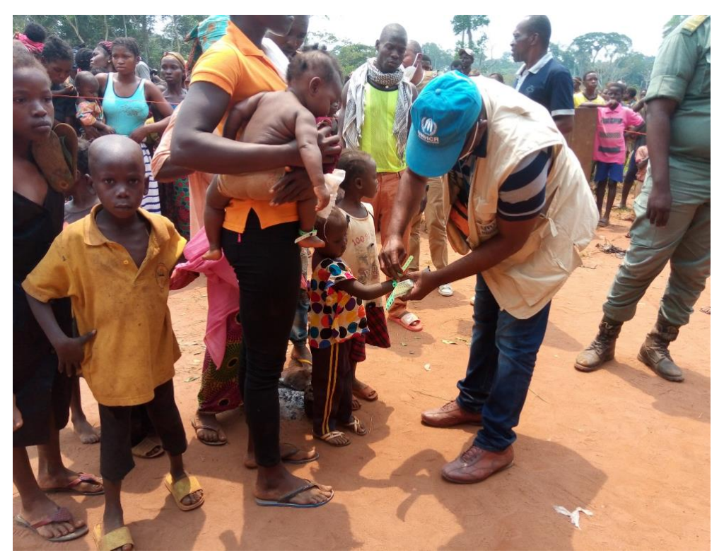
UNHCR staff provide bracelets for emergency registration to newly arriving Central African refugees in Ndongo-missa, Republic of the Congo.