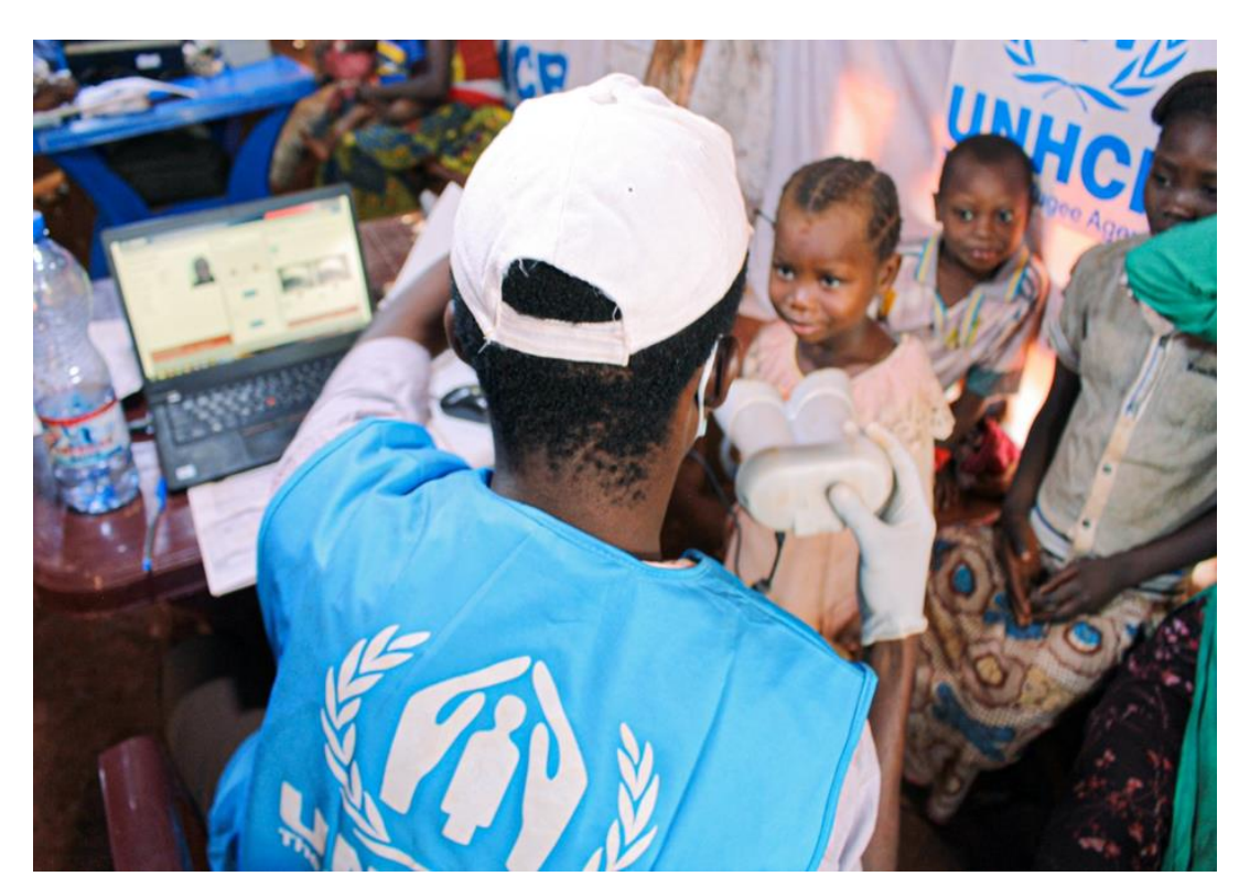
A family of Central African refugees are biometrically registered by UNHCR staff in the village of Ndu, Bas Uele Province, Democratic Republic of the Congo.