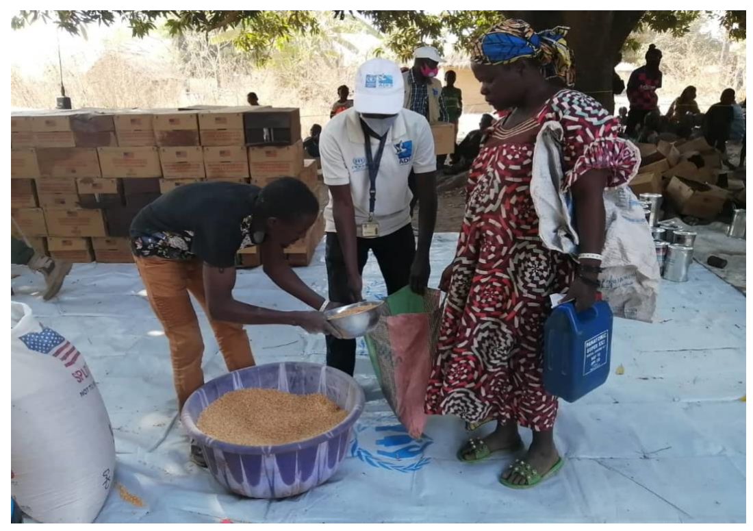
Food distribution organized by WFP for newly arrived refugees in the border village of Ndouba-soh, in Southern Chad.

UNHCR continues to assist new arrivals in border villages while arrangements are being made for more durable shelters. So far, As of 15 Feb, 3,137 new arrivals were provided with NFIs kits (including blankets, mats, Jerry cans, kitchen kits, mosquito nets) and 3,681 are receiving food rations with the support of WFP.