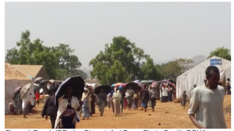
Figure 1 Ranch IDP site, Chagni, Awi Zone.

Mohammed, 65, is one those IDPs who witnesses the horrific experiences of ethnic-based killings in Metekel. Mohammed