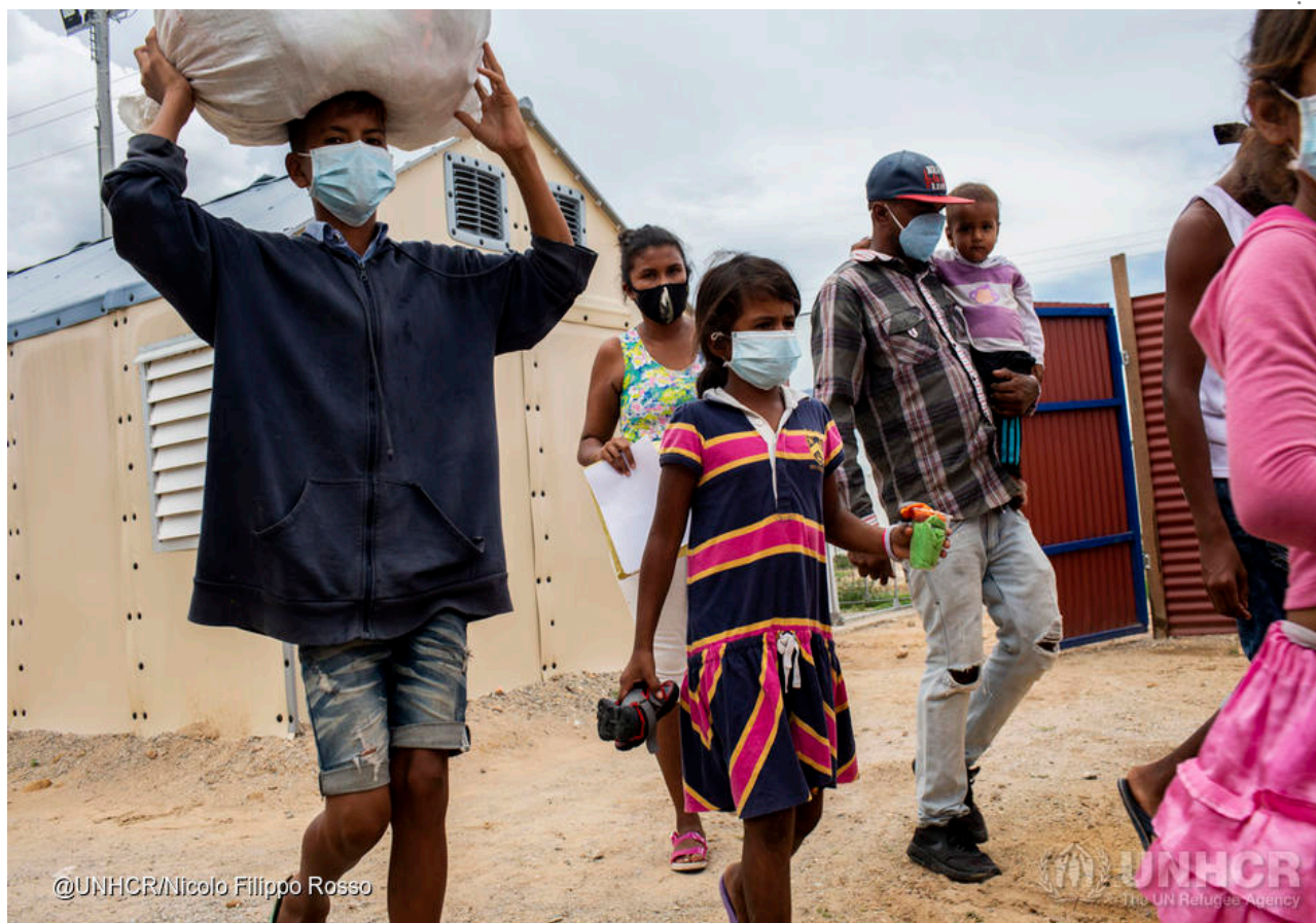
In Maicao, La Guajira department, UNHCR provides shelter to Venezuela refugees and migrants at the Integrated Assistance Centre

For more than two decades, UNHCR has worked closely with national and local authorities and civil society in Colombia to mobilize protection and advance solutions for people who have been forcibly displaced. UNHCR's initial focus on internal displacement has expanded in the last few years to include Venezuelans and Colombians coming from Venezuela. Within an interagency platform, UNHCR supports efforts by the Government of Colombia to manage large-scale mixed movements with a protection orientation in the current COVID-19 pandemic and is equally active in preventing statelessness.