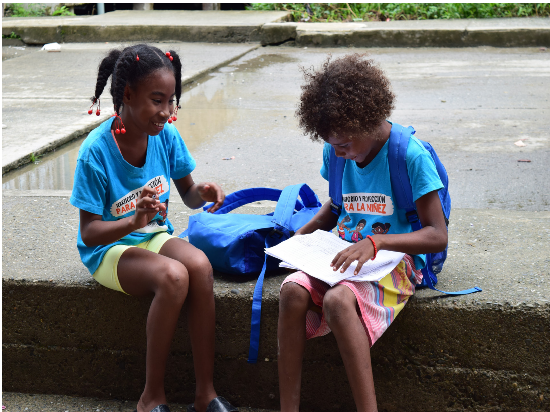
UNHCR in coordination with its partner, Fundescodes, provides child-friendly spaces for boys, girls and adolescents in Buenaventura, Valle del Cauca department.

While Colombia's asylum system has offered protection to a small but growing number of Venezuelans, many Venezuelans seek to regularize their stay through the Special Stay Permit (PEP), which enables access to legal employment. The PEP currently allows over 708,000 Venezuelans to reside legally in Colombia for up to two years with access to basic services and the labour market. Despite this high number, some 56% Venezuelans in Colombia find themselves in an irregular situation and thus more vulnerable to protection risks.