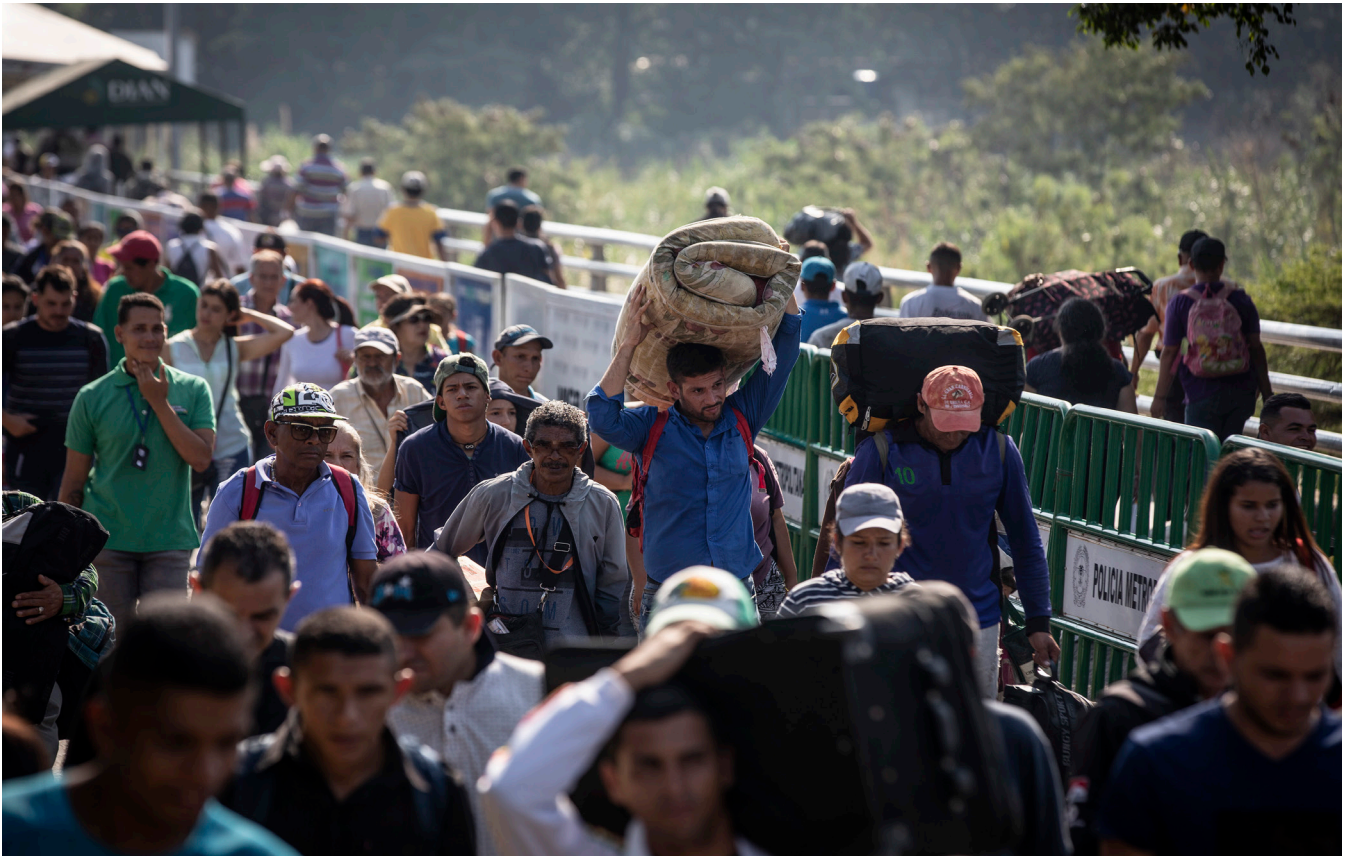
Venezuelan refugees and migrants cross the Simon Bolivar Bridge, one of seven legal entry points on the Colombia-Venezuela border and the most prominent entry point in Colombia. Prior to the March 2020 border closure, 30,000 people crossed this bridge into Colombia on a daily basis.

Specifically, UNHCR's main activities with Venezuelans and Colombians returning from Venezuela include: