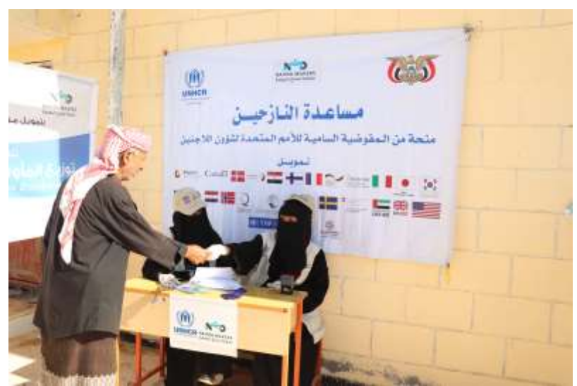
A displaced man hand over his ID at a non-food items distribution site in Abyan.

UNHCR partners in the south included: Al-hikma Al-yamania Association for Charity (HYAC), Field Medical Foundation (FMF), Human Acess (previously Charitable Society for Social Welfare (CSSW)), the International Organization for Migration (IOM), INTERSOS, Al-Magd Charitable & Humanitarian Relief & Development (MCHR), Nahdha Makers Organisation (NMO), Norwegian Refugee Council (NRC), Society for Humanitarian Solidarity (SHS), UNICEF and the UN World Food Programme (WFP).