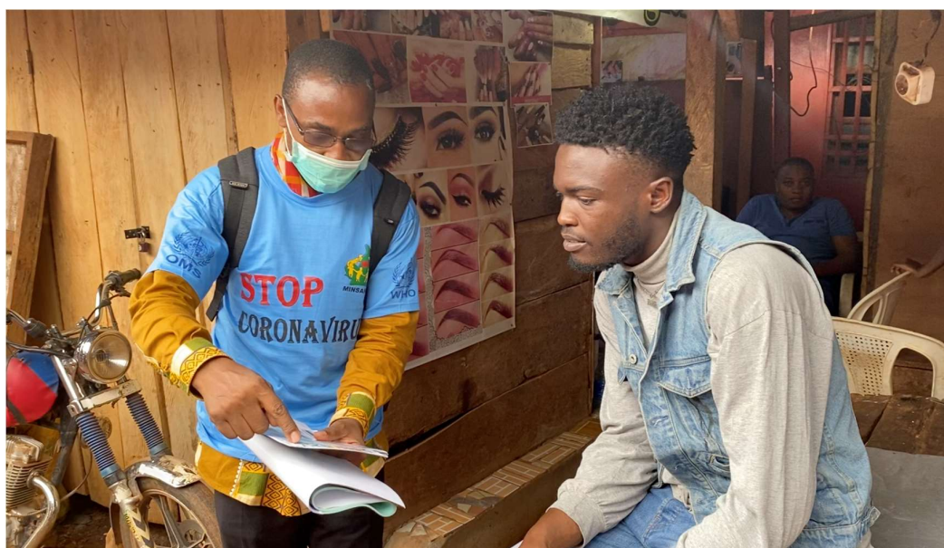
WHO COVID-19 sensitization activity in the Centre region

Cameroon is facing a significant upsurge in COVID-19 cases. According to the Ministry of Public Health, more than 5,000 new cases have been recorded between November and December 2020. The Littoral, Centre and Far North regions registered the highest number of cases.