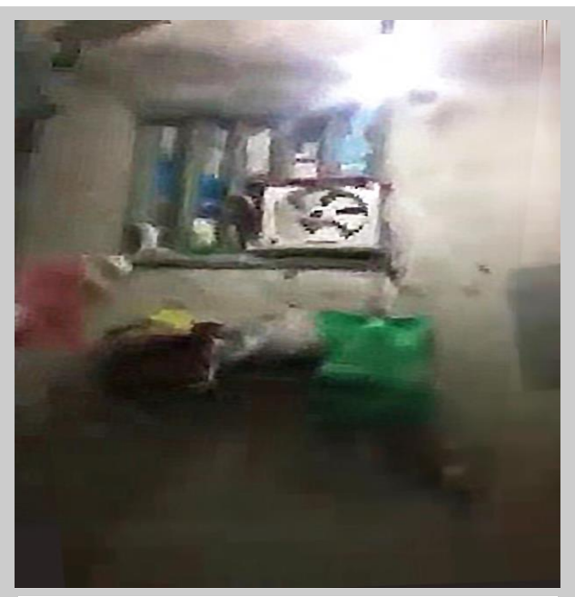
Still taken from video filmed in Al-Aqrab Prison in October 2020 and shared with Amnesty International