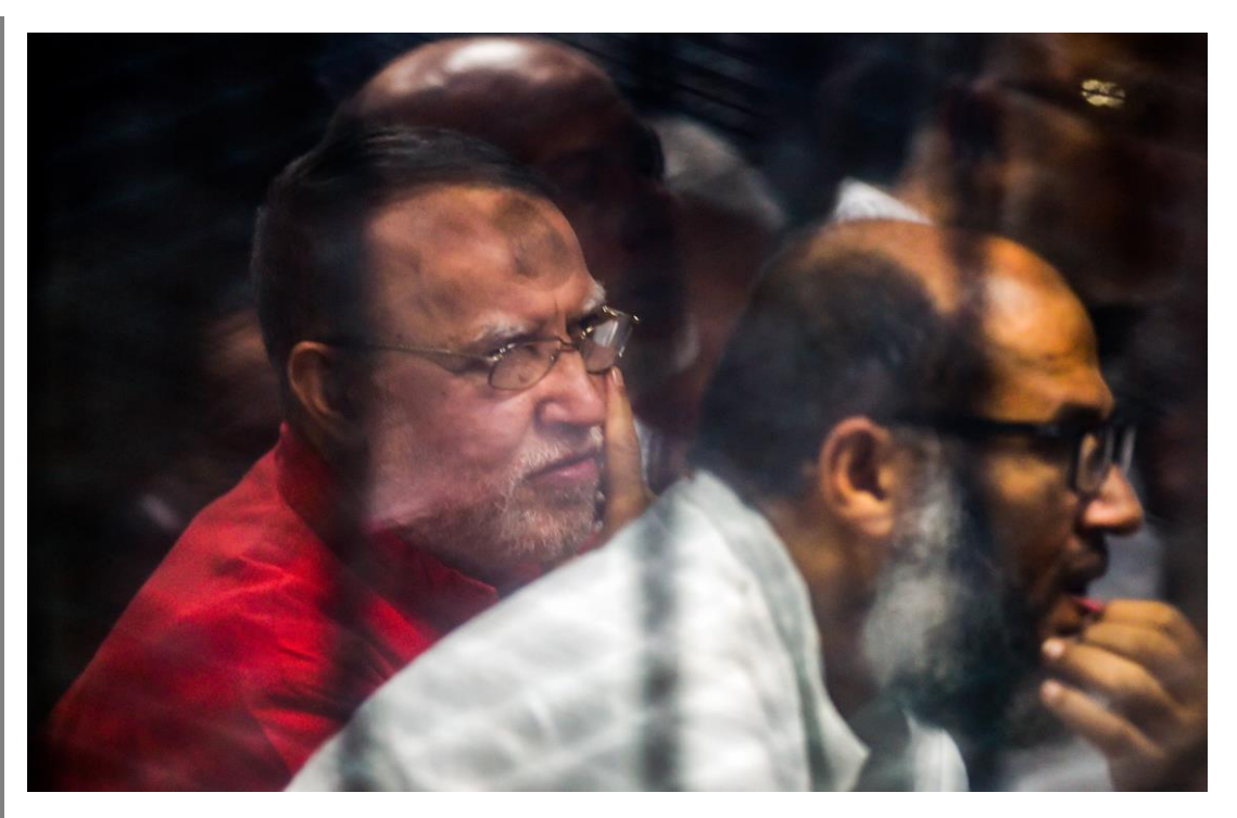
Essam el-Erian

High-profile members of the Muslim Brotherhood are among those who are deliberately denied health care.