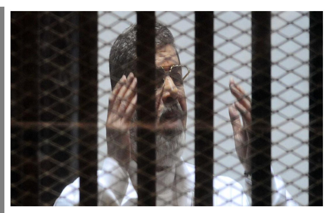
Mohamed Morsi

Those held in prolonged and indefinite solitary confinement, in and of itself amounting to torture, cut off from the outside world in conditions facilitating torture and other ill-treatment, and denied adequate health care are at particular risk of suffering from medical complications and dying in custody (See Chapter 3.5).