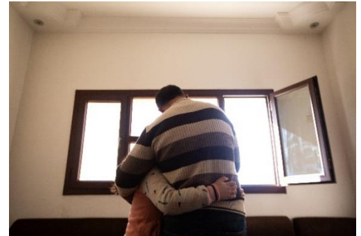
One family's departure and new beginning.

This week has seen the departure of a Syrian refugee family from Libya, bound for North America on a resettlement flight . One member of the family, a six-year old child, has severe medical difficulties and will now be able to receive long-awaited care and treatment, after many months of searching for help. UNHCR was able to assist the family in preparing for their move, by arranging temporary accommodation for them in Tripoli and helping them meet their basic needs, while other medical checks and paperwork were finalized prior to their departure.