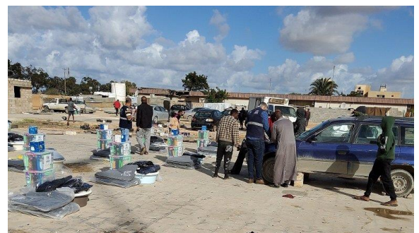
Distribution of winter items at three IDP settlements in Benghazi.

UNHCR continues to support the internally displaced (IDPs) who were forced to flee their homes but remained in the country. On 1 December, UNHCR through its partner, LibAid distributed CRIs to 74 internally displaced Tawerghan families at three locations in Benghazi, as part of a winter distribution campaign. Assistance included solar lamps, blankets, kitchen sets, wet wipes, hygiene kits, socks, hand sanitizers, jerry cans and plastic sheets. Over 5,000 IDPs were reached in the first phase of UNHCR's winter distribution campaign. So far in 2020, over 33,700 IDPs were supported CRIs.