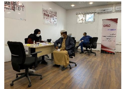
CBI distributions are ongoing.

UNHCR uses cash-based interventions (CBIs) to provide protection, assistance and services to the most vulnerable. Last week, UNHCR's partner, CESVI provided cash assistance to 15 refugees and asylum-seekers at the Community Day Centre (CDC) in Tripoli. Partner the Danish Refugee Council started the distribution of pre-paid cash cards with 304 displaced families having received CBIs. In southern and eastern Libya, partner ACTED provided pre-paid cash cards to 422 IDPs in Sebha and Benghazi. So far this year, UNHCR has supported over 7,400 individuals with CBIs.