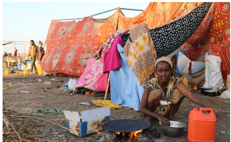
Figure 1 Tens of thousands of refugees are crossing the border from Ethiopia to Sudan, fleeing conflict in Ethiopia's Tigray region. Many of them arriving in Hamdayet Reception Center where humanitarian partners are responding to their immediate needs. WFP has been on ground since day one, providing emergency food and logistics support. 17 November 2020.

According to UNHCR, more than 41,000 people have now fled to Sudan, including over 18,000 children and 57 per cent males, as of 24 November. In Sudan, due to limited capacity at the transit areas, some refugees are living in market areas in Hamdayet, while others are hosted by the community in nearby villages. UNHCR has revised its planning figures for refugees due to the conflict in Tigray region to assist between 210,000 and 215,000 refugees over the next six months, with the vast majority (200,000) in the Sudan side of the border. Priority needs include nutrition and food assistance as well as water, sanitation and hygiene and shelter. At least 16 children have