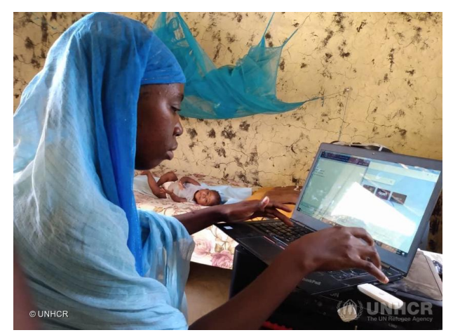
Berepayo, a Congolese DAFI Scholar in South Sudan.

UNHCR is working to ensure that tertiary students can resume and complete their studies safely and in line with national COVID-19 guidelines. UNHCR has continued to pay student allowances to those experiencing closure of institutions during this period, supported students with transportation costs, and planned for students' access to COVID-19 testing or treatment, as necessary. UNHCR and partners also continue to support students to make