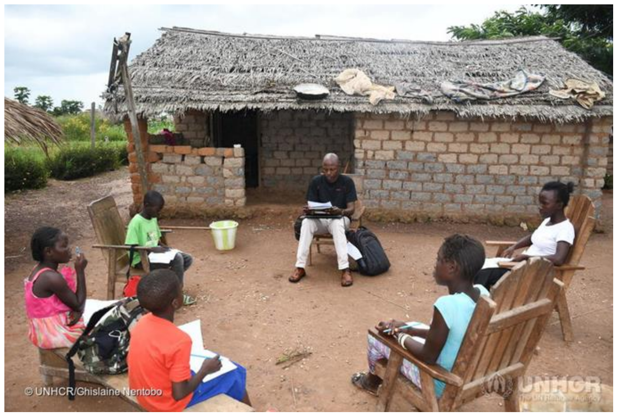
Burundian refugee children home schooling for exams in the Democratic Republic of Congo.